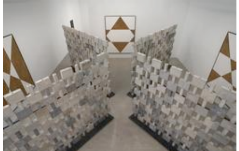
Shot of Mark Hagen's show "TBA" at China Art Objects

These photographs are as much about depiction as redepiction. The frames are carefully selected to play with colors in the image and are smartly placed in the gallery about where the photo's subject would be in a visitor center. Some are in photographic sculptures that play with the elements of re-presentation, including Slot Canyon , a light box that mimics the soda machine it's capturing. At Ghebaly, Lepore has crafted a topographical map platform with a staircase leading up to it, blocked off with a bit of chain to unauthorized personnel, as it were. These photographs aren't just images, but objects attempting to impact the gallery space.