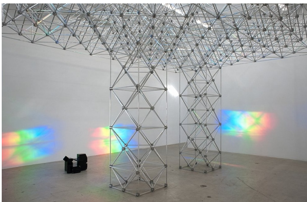
Mark Hagen, The Alhambra, 2013, aluminum and stainless steel space frame, 153 x 182 x 242.