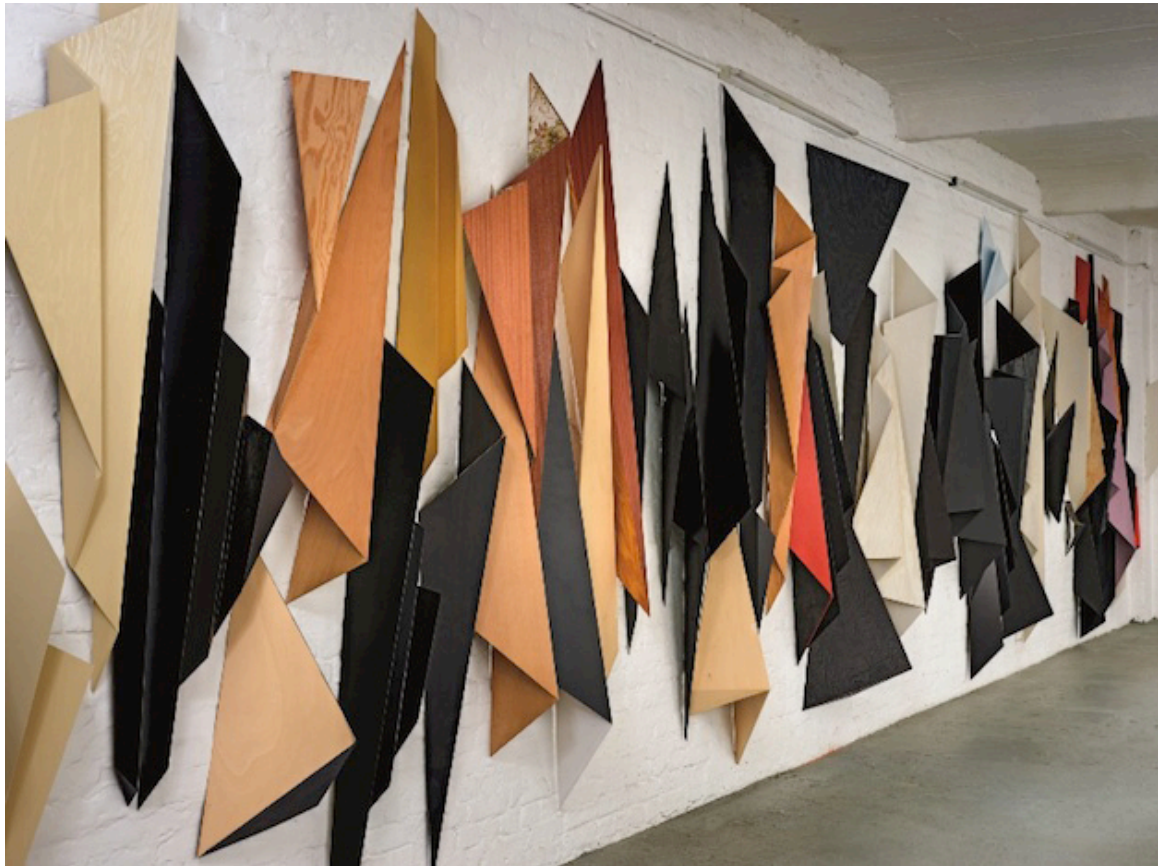
«Zeitraum» by Katja Strunz, one of a number of german artists at the São Paulo Biennial

Artsation: 'Second oldest biennial of the world : 30st Edition of São Paulo Biennial is now open for public until December 9', September 10th, 2012