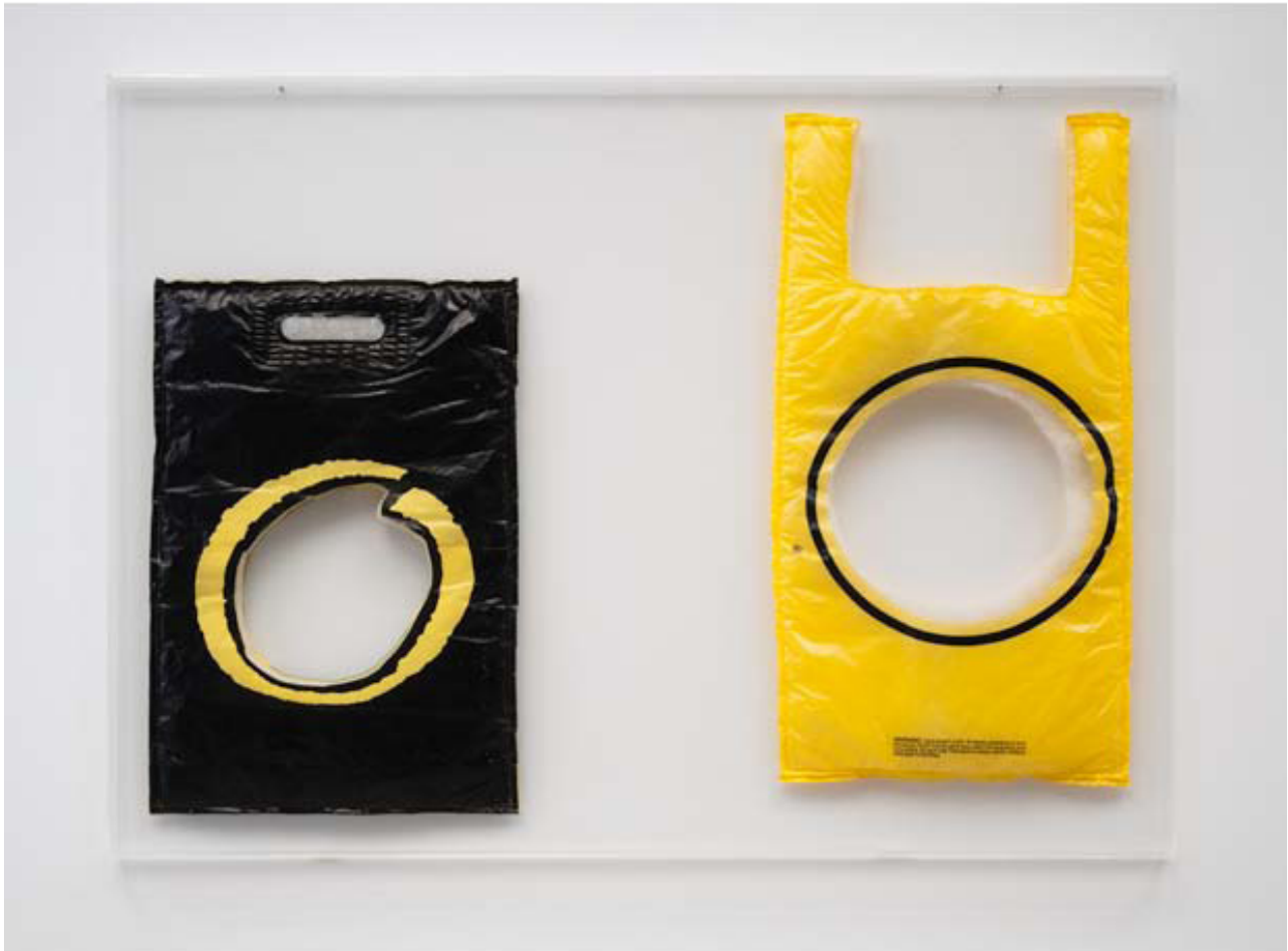
Parque Industrial - Edouard Fraipont

With Brazil in the ascendency the Sao Paulo Bienal steps up a gear and is widely hailed as the best in history