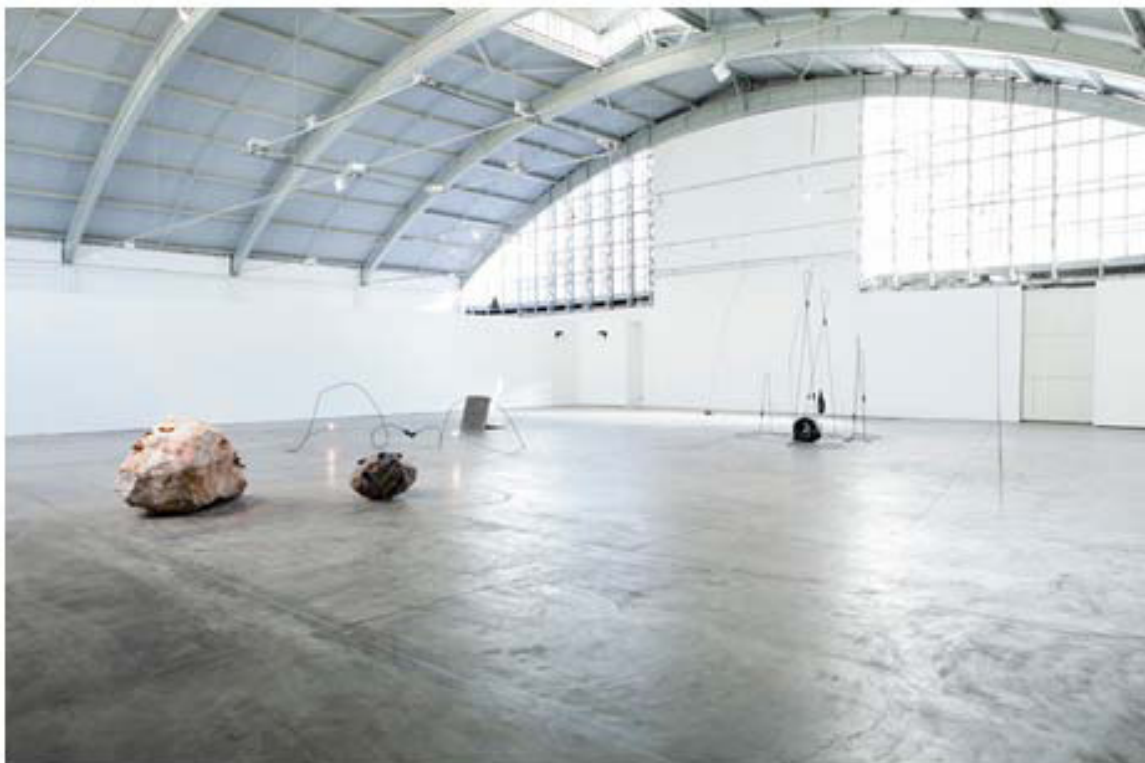
Baro Sunday Night Felipeçensi