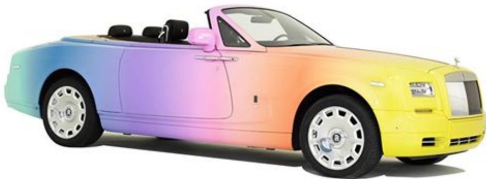
Ugo Rondinone painted a Rolls Royce Phantom Drophead Coupé in the colors of a California sunset for the opening of the show