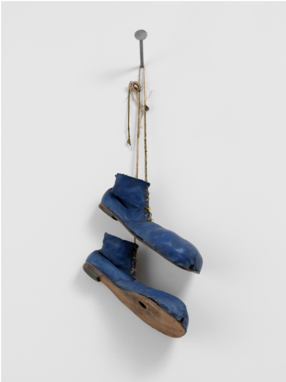
Ugo Rondinone, "no one's voice", artificially aged clown shoes of leather, wooden nail, paint, 2006, © studio rondinone, 2014

乌戈·罗迪纳, 《没有谁的声音》, 旧人造皮鞋、木钉、颜料, 2006, © Rondinone 工作室, 2014