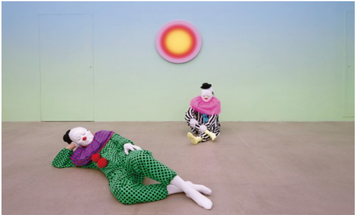
Front : Ugo Rondinone, "if there were anywhere but desert. 0", Polyester resin, fiberglass, clothing, fabric, glitter, 2000, photographed by Stefan Altenburger, © studio rondinone, 2014

前景：乌戈·罗迪纳，《除了沙漠如果有任何存在的地方。0》，聚酯树脂，玻璃纤维，服装，织品，金葱粉，2000，由Stefan Altenburger拍摄，© Rondinone 工作室，2014