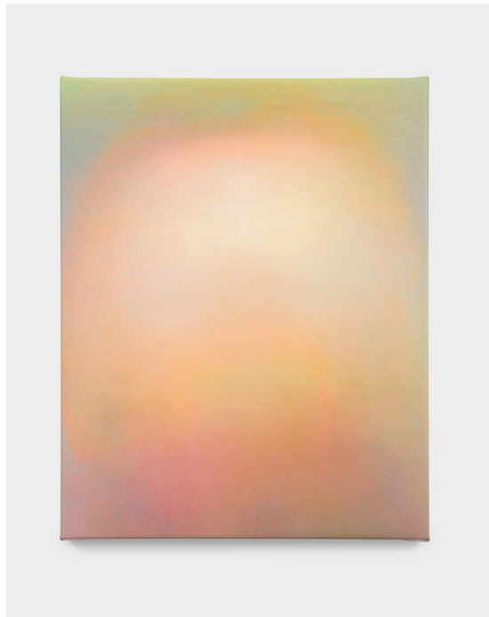
Gioele Amaro, Piece of a Piece , 2022, Ink and varnish on canvas, 158 x 140 cm 62 x 55 in.