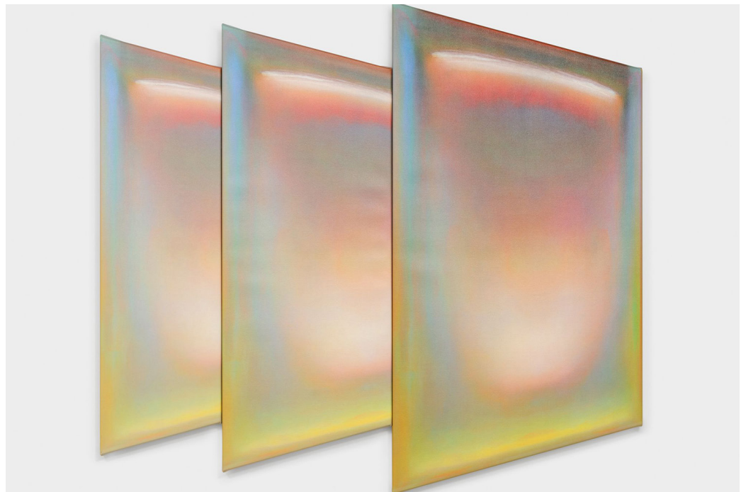
Gioele Amaro, P-Painting! , 2022, Ink and varnish on canvas, 158 x 140 cm 62 x 55 in.