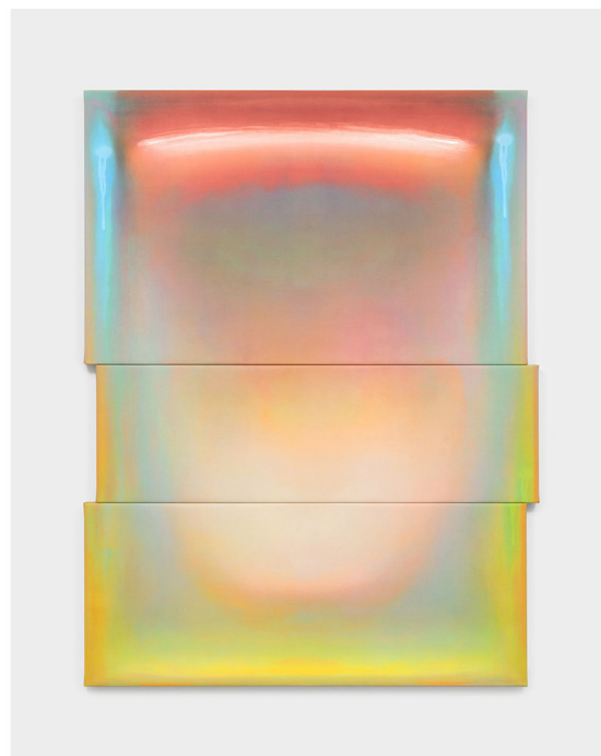
Gioele Amaro, Sliced Licence , 2022, Ink and varnish on canvas, 158 x 140 cm 62 x 55 in.