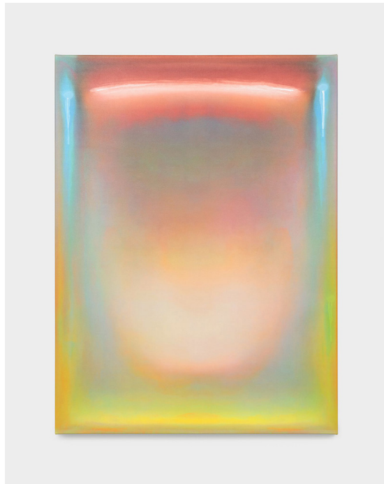
Gioele Amaro, Creator's gate , 2022, Ink and varnish on canvas, 158 x 140 cm 62 x 55 in.