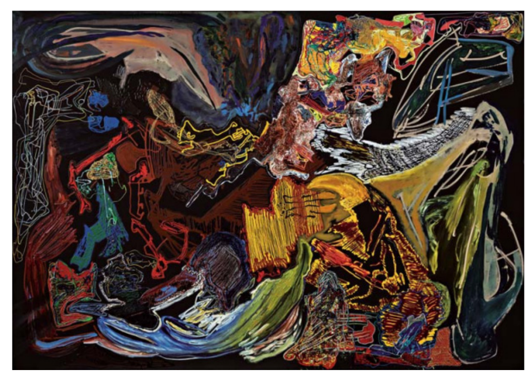
Leelee Kimmel, Night Rider , 2021, Oil, oil stick, arcrylic on canvas, 193 x 274.3cm © Leelee Kimmel - Courtesy of the Artist and Almine Rech - Photo: Charles Roussel