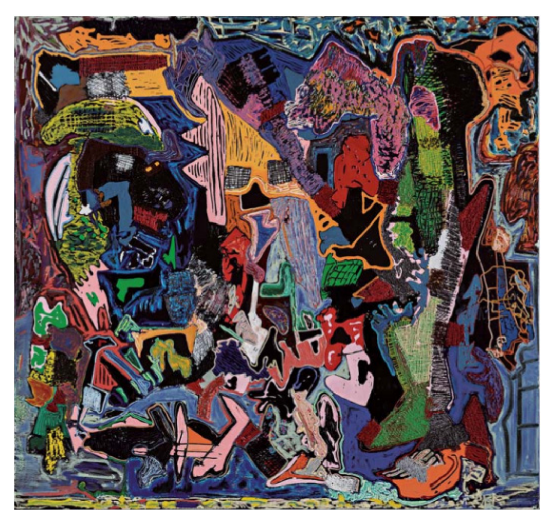
Leelee Kimmel, How Many Birds Nocturnal Jungle , 2021, Oil, oil stick, arcrylic on canvas, 165.1 x 175.3cm © Leelee Kimmel - Courtesy of the Artist and Almine Rech - Photo: Charles Roussel

After a certain number of steps, when the artist is sure that the "creature forms" in the picture have begun to develop their own stories, he hangs the cloth vertically and continues to work in the same way until the work is completed. At this point, Kimmel is no longer the same as the one who is completely immersed in the end, but has become a general at the helm of a warhorse, who is able to control the whole situation.