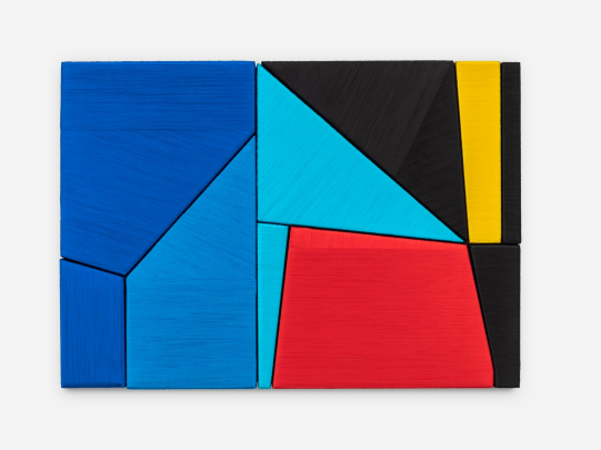
Alice Anderson, RANDOM CHROMATICS PERFORMANCES / PIXELS N.47 , 2021, Wood, wire 46 x 40 18 1/8 x 15 3/4