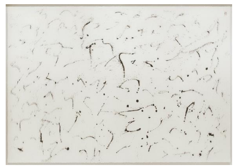
Minjung Kim, Phasing, 2017. Mixed media on mulberry Hanji paper, 57 x 81 1/2 inches.

Kim : Yes, this is the "Phasing" series, this work, you don't see much through this. There are three layers of the paper, first I do a gesture, and then I put another paper—thinner—above the painted paper. And I take it out with incense, take out the painted part. So this is two papers. One painted with gesture, the other one I burned out. So there's a hole in this paper, and I put together, glue it, then I put another thick paper behind it to fix up. So this is three layers of paper. It is like you have two different emotions, two different characters of yourself. One, when you do the gesture, you are impulsive, use faster movement, you are convincing, it's a powerful movement. In the second movement, you look at your past, you take out where your power has been, so make an empty part. But it's so slow, cause you are getting it the instant, taking out these forms. So it's a completely different attitude with the paper, and then I put it together, and you get two different characters together in one work.