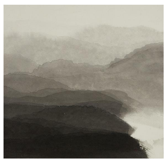
Minjung Kim, Mountain, 2018. Ink on mulberry Hanji paper, 28 3/4 x 30 1/4 inches.

Kim: Yeah. You can go on with the other imagination of the mountain.