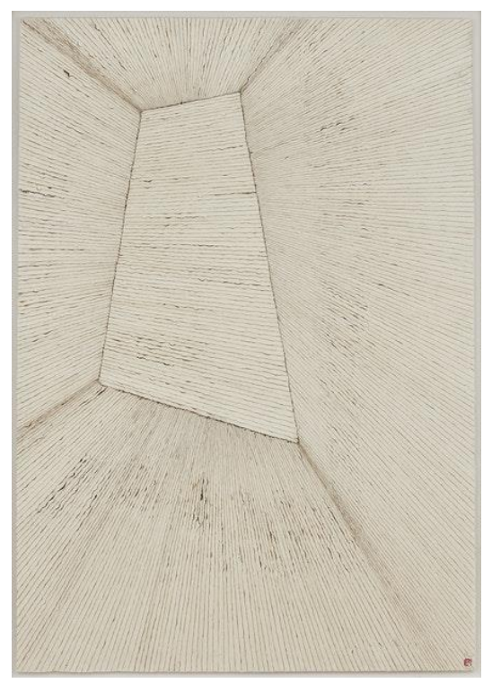
Minjung Kim, The Room, 2007. Mixed media on mulberry Hanji paper, 79 1/2 x 56 inches. Courtesy the artist.

Kim: I read some funny book, by Osho, that there are so many different kinds of meditation. One kind of meditation can make you feel like your mind goes floating up in your room, and suddenly yourself becomes too big and you call fill yourself up in the room. So I thought about "what if my spirit departed from my body and went on the top of the ceiling, how would the room look?" Then I made a very funny geometric form of the room because I didn't know how to use a computer for the perspective so it comes out very interesting in its geometric form. You can see I did always this stripe and edge and it's just collage. I cut, and burn, and collage for this form.