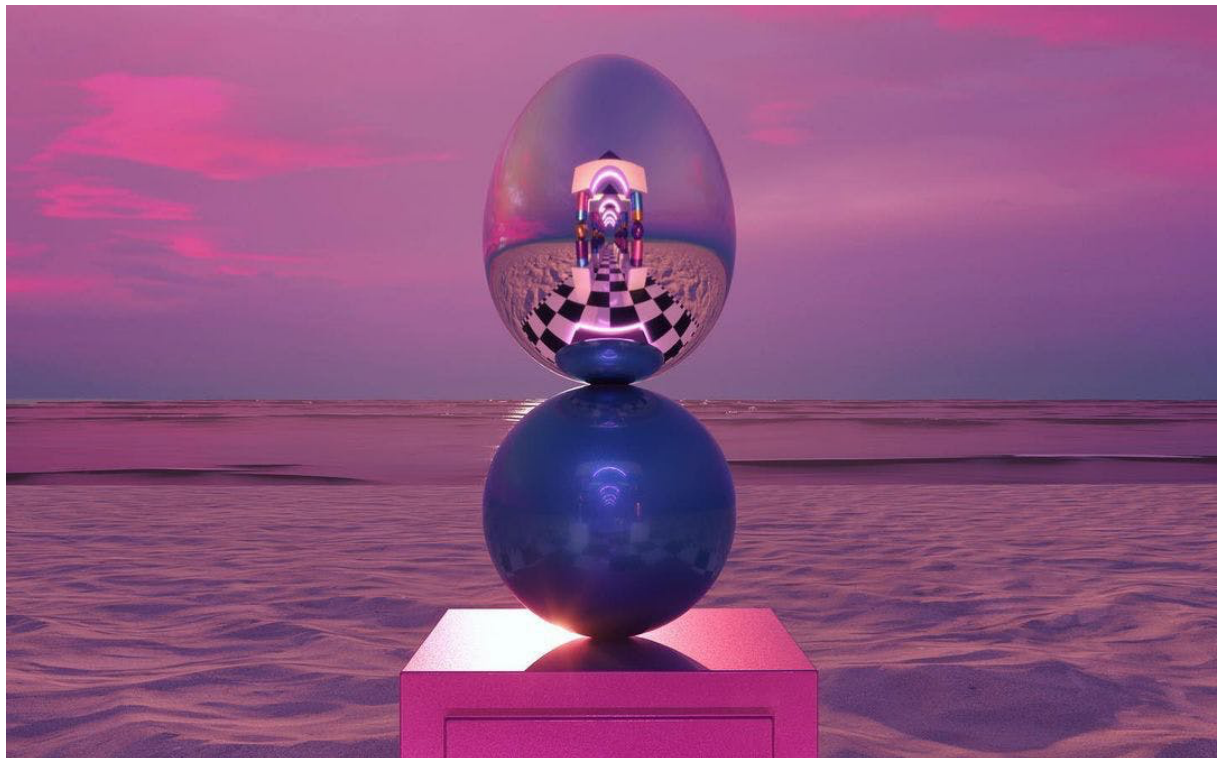
Pilar Zeta's "Hall of Visions" / @pilar_zeta. Courtesy of Pilar Zeta and Faena Art

WHEN: Nov 30–Dec 5. TICKETS: Free admission