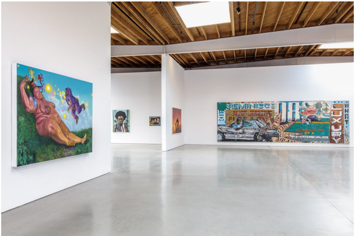
Jeffrey Deitch 'Shattered Glass' 2021.