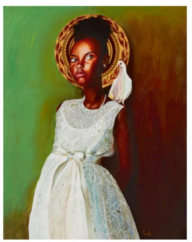
Otis Kwame Kye Quaicoe, Girl in White Dress , 2018.