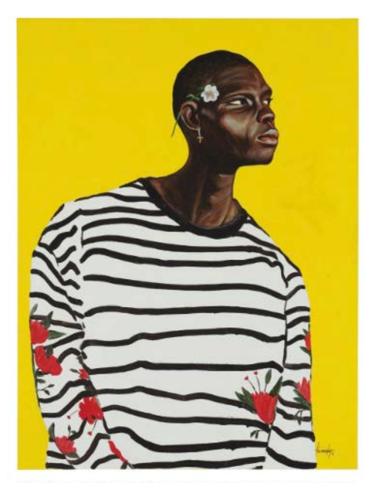
Otis Kwame Kye Quaicoe, Black Stripes on White , 2019.

This fall auction season has been anything but business as usual. Unmoored from the usual calendar of sales by the pandemic, resulting economic downturn, and unease in anticipation of the United States presidential election, auction houses Christie's, Phillips, and Sotheby's packed most of their contemporary art auctions across Hong Kong, London, and New York into a single month starting in late September, with mixed results.