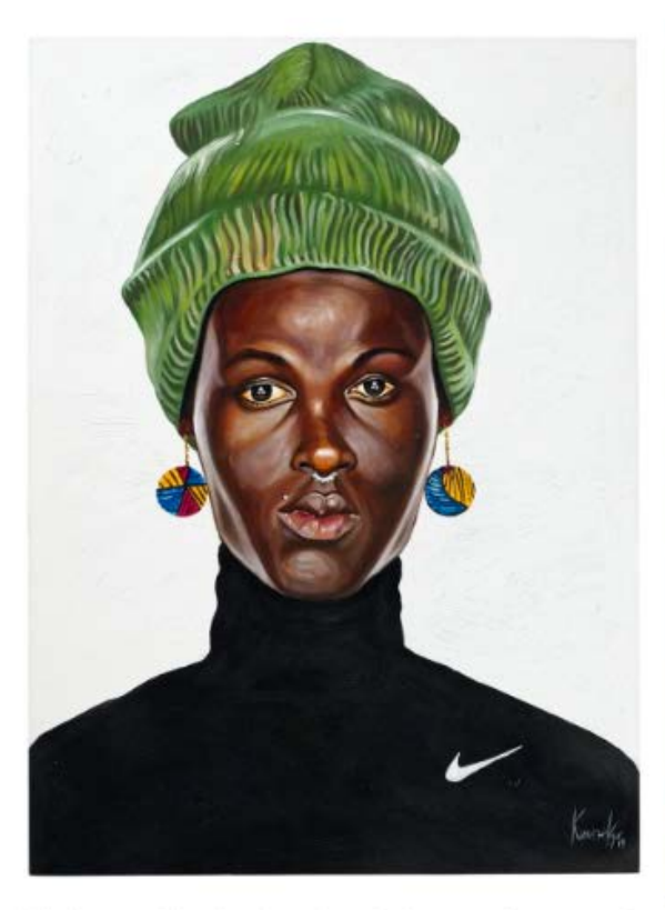
Otis Kwame Kye Quaicoe, Just Do I t, 2019.