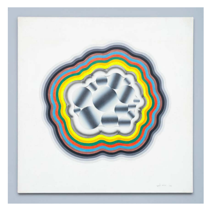
"Composition," 1970.

Once he found that motif, critical and commercial success came fast, and he was soon showing regularly in Europe, North America and Asia. He conjured his ephemeral drops in airbrush and oil, hovering over or soaked into materials like hemp canvas, linen, wood, newsprint and Korean hanji paper made of mulberry bark. In the 1980s, he began integrating Chinese characters, using text he had learned from his grandfather.