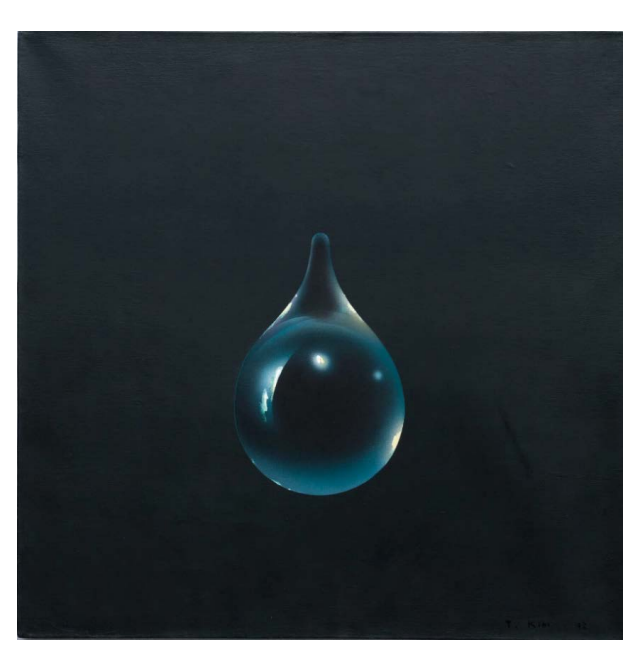
"Événement de la nuit," 1972; oil on linen.