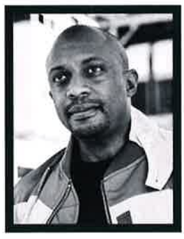
Hank WILLIS THOMAS

HWT : I really believe that artists are prophetic or psychic and that when we make work, we are actually touching something much deeper in the