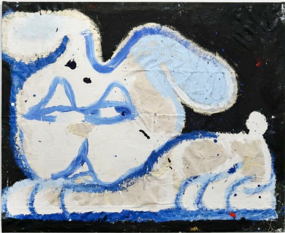
Local Soft Body , 2015.

Although the majority of his portraits appear to be standing humans, they are melded with traits from other creatures such as rabbits, praying mantises, and frogs. Only two paintings, both titled Local Soft Body , are unmistakably more bunny than man. The anatomies of several bodies are compressed, making them unusually contorted and hard to decipher immediately as a rendered figure. Untitled (Figure) , TS Dual Postup , and Mystic Taxi are the pieces that most quickly deteriorate into organic shapes. All lacking torsos, their midsections are nothing but a flimsy connecting point for ballooned hands, feet, and faces. Perhaps unintentionally, the characters look like a personified cortical homunculus , a diagram that visualizes the brain's sensorial relationship to parts of the body through scale. Floratos' paintings want to induce a corporal effect on the viewer, to heighten their awareness of the sensitive areas of their own bodies, where nerve endings are densely clustered.