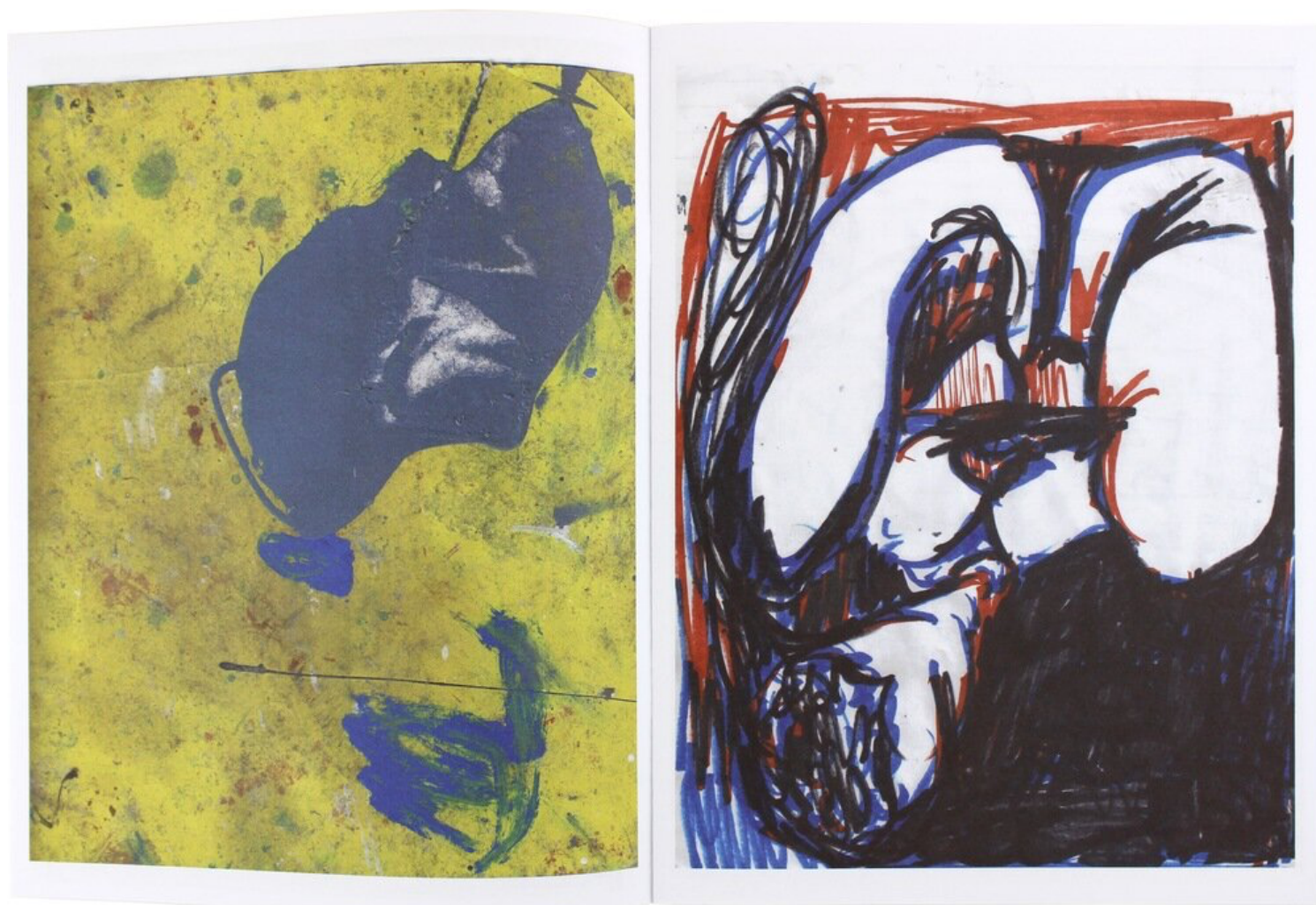
Spread from the zine by Gerasimos Floratos and Eddie Martinez ( image courtesy of Chris Mansour ).

B-Boys , and other riff raff. At once reclined and in mid-pose, the figures, with their squinted eyes and blunts in mouth, conspicuously sport baggy clothes, bulky sneakers, Kangol caps, or large belt buckles. Their standoffish composure and look of suspicion or inebriation shows the emotional weathering they are subjected to as city slickers. In fact, the residue embedded on the paintings' surfaces reflects the grittiness of street life, capturing dirt like a makeshift air filter. They act as a reminder that despite all the superficial cleansing programs that metropolises are implementing – concealing graffiti and tag markings, planting flowers in empty lots, or the dislocation of the homeless and drug addicts – the grime of urban life persistently returns since the source is never truly addressed. Floratos's paintings scrape at the underbelly of society and prominently display its undesirable elements – the ones that cities obsessed with sanitation go at lengths to conceal. But the work looks more goofy than menacing, as the characters appear to always be "keeping it cool." Whether or not this trait can be read as an ode to a style, or a representation of a defense mechanism, is up for the viewers to decide.