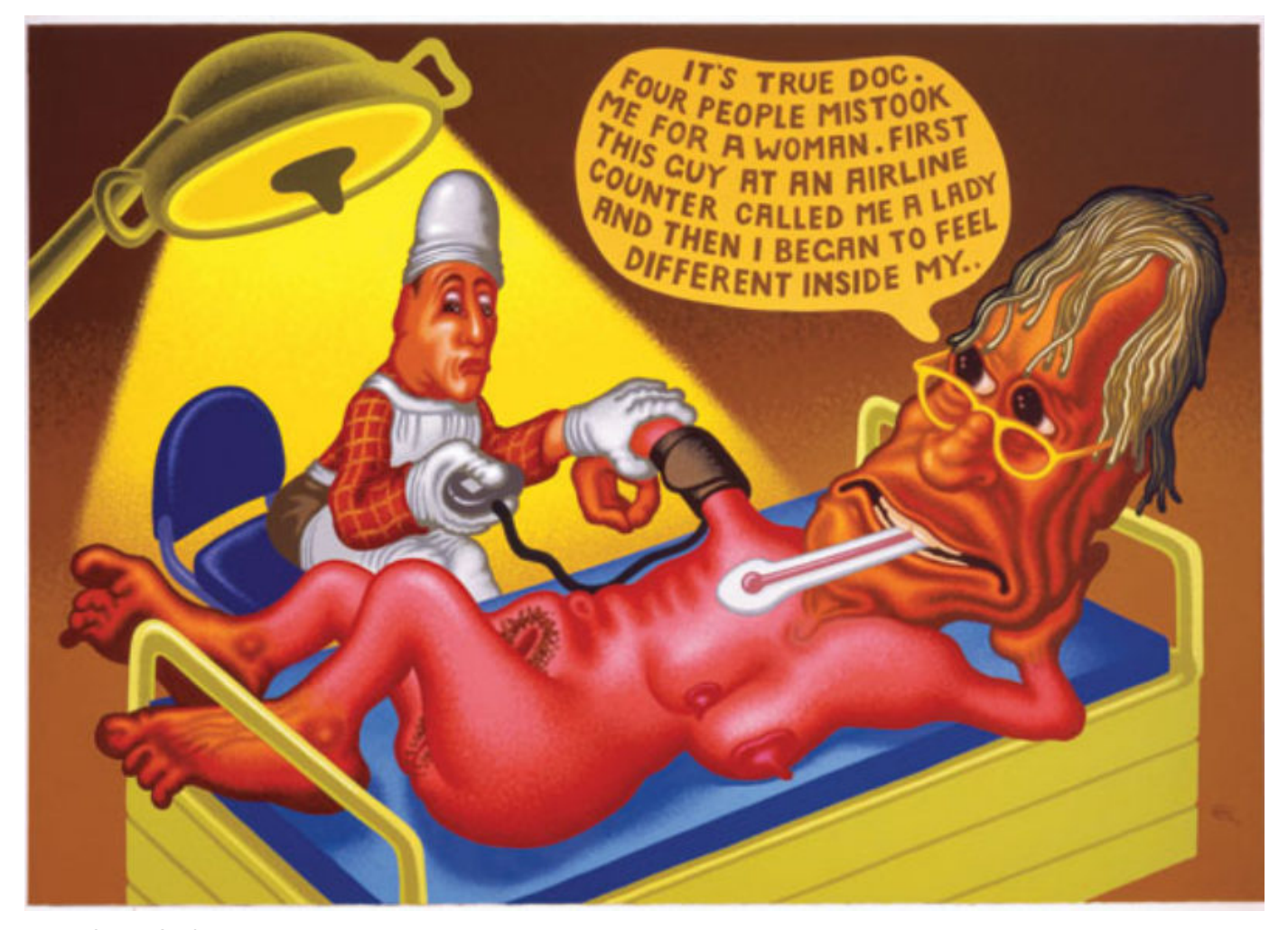
Peter Saul, Self Portrait as a Woman, 2006, acrylic on canvas, 72 x 102 inches.

Do you think of your paintings as conversation-starters, given their politics, their bad taste?