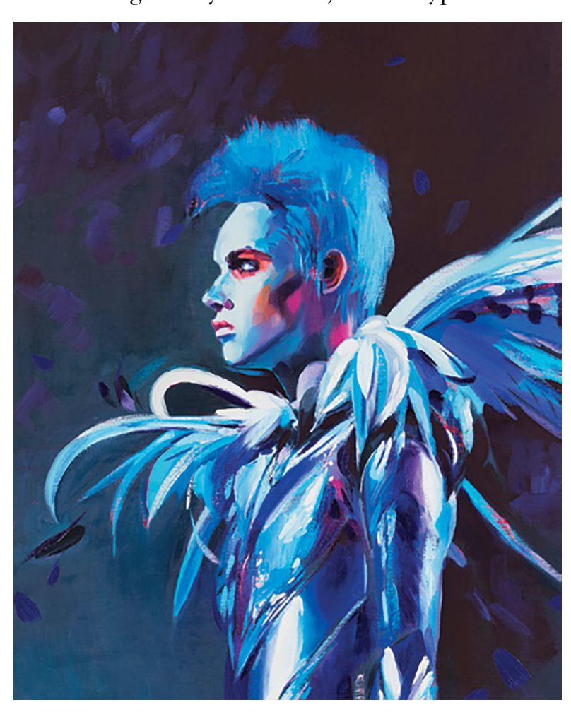
Sam McKinniss, Brian Slade, 2016, oil and acrylic on canvas, 30 × 24".

McKinniss's paintings, nearly always derived from found photographs or JPEGS, range from the size of a piece of copy paper to the imposing dimensions of a royal portrait; he renders them freehand, without using grids or projections. Close up, his figures and faces shed their resemblance to the source images and break down into mottled patches and veils of color, legible brushstrokes, the overt paraphernalia of illusionism. Often the subject nearly fills the entire canvas, with a spare, indeterminate background space setting it off. McKinniss invests faces with high drama; they are suspenseful in that the viewer naturally imagines the next moment, and the moment before, and can't quite define the vaguely troubled emotional flavor of the moment at hand. Eyes do a lot of work in McKinniss's paintings; so do hair and spiky things, like the daisies in Drew Barrymore's hair, the white stitches of Catwoman's costume, Edward Scissorhands' hands and hair, the garish feathers surrounding Marilyn Manson, or the crypto-Bowie of Brian Slade , 2016.