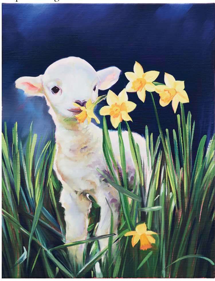
Sam McKinniss, Lamb , 2017, oil and acrylic on canvas, 18 × 14".

For me, the best of McKinniss's paintings express exuberance and dread in equal measure: the very large Swan II , 2016, where the elegant, backlit form of the bird is its only visible aspect, centered in a dwarfing expanse of gliding, possibly toxic, nighttime riverine colors, and the strangely sublime Flipper , 2016, in which this lovable aquatic mammal, completing a dive, leaves a trail of spectacular bubbles and looks both joyous and—what we unavoidably bring to this picture—doomed. McKinniss is well aware that any depiction of innocence, in our era, immediately evokes the prospect of violation, which gives a painting like Lamb , 2017—an adorable lamb sniffing a jonquil in some high grass—a certain desperate edge.