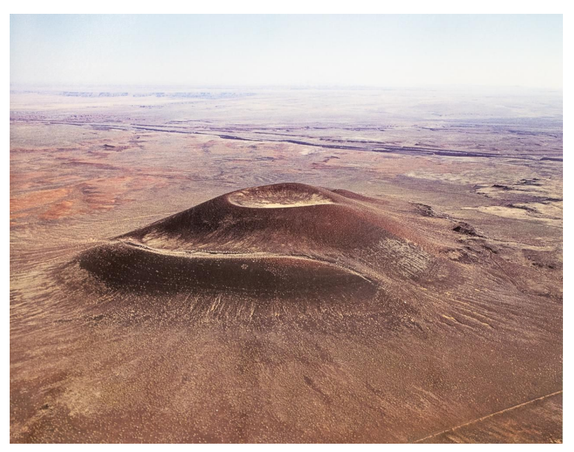
VIEW FROM THE TOP "That looks pretty terrific, I thought," recalls Turrell of first seeing the Roden Crater (pictured above in 1973). "I landed right out below it and then hiked up in it, then spent the night in it, in a sleeping bag." PHOTO: JAMES TURRELL, RODEN CRATER, © JAMES TURRELL, PHOTO BY JAMES TURRELL (1973). NEXT PAGE:

celestial bodies, is modeled on the Jai Prakash Yantra timepiece at Jantar Mantar in Jaipur, India.