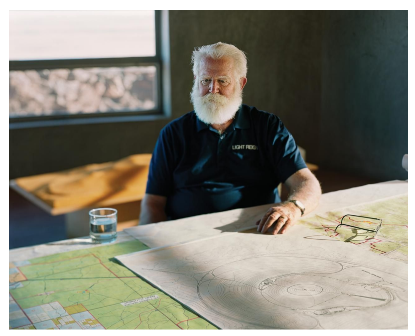
MAPPED OUT "I don't want people to come here, see it once, and then you've checked it off your bucket list and can forget it," says James Turrell, surrounded by Roden Crater blueprints, "so you have to have an ongoing program."

The artist has dedicated half his life to creating a massive—yet largely unseen—work of art. After more than four decades, he reveals a new master plan to the public