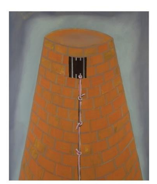
Francesco Clemente, "Tower of Song" (2017), oil on canvas

"Hello and Goodbye" hangs cleverly next to works that also focus on line-making. The shoulders, torso, knees, and head in Frank Auerbach's portrait, "David Landau Seated" (2013-15), emerge with dark, angled brushstrokes from a sludge of pastel-colored paint. Haunting, hollow eyes and an expressionless face match the mask-like figure in Picasso's "L'Homme au chapeau de paille" (1964), one of the exhibition's only paintings not created in the past couple of decades, but included for its influence on the others. Picasso's dashes