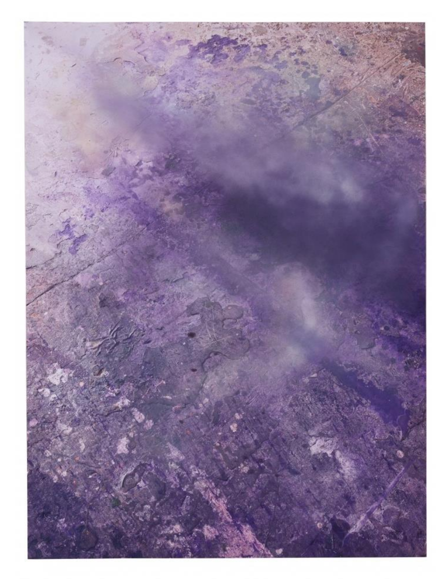
Julian Schnabel, "Ascension IV^n (2015) (image courtesy the artist and Almine Rech Gallery, photo by Argenis Apolinario)

Some of the best paintings in the London show appear in the first room. Howard Hodgkin's unassuming diptych "Hello and Goodbye" (2014–15) features two small wood panels joined side by side. On the left, a black arc — made from three thick, rough brushstrokes piled almost on top of each other — is painted on bare wood. On the right panel, which is slightly shorter in length, the arc is wider and green, and sits on a black background. With just a few lines and colors, Hodgkin suggests the sun rising and setting, or, perhaps, a timid greeting when you first meet someone, followed by a more heartfelt goodbye after getting to know them. (Rosenthal explained to me at the opening that he put Hodgkin in the Now show in London — instead of the Then show in New York — because he thinks that "Hodgkin's greatest paintings are his last ones".)