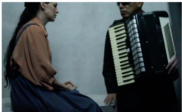
Behind the scenes at Simon's New York performance at Park Avenue Armory.