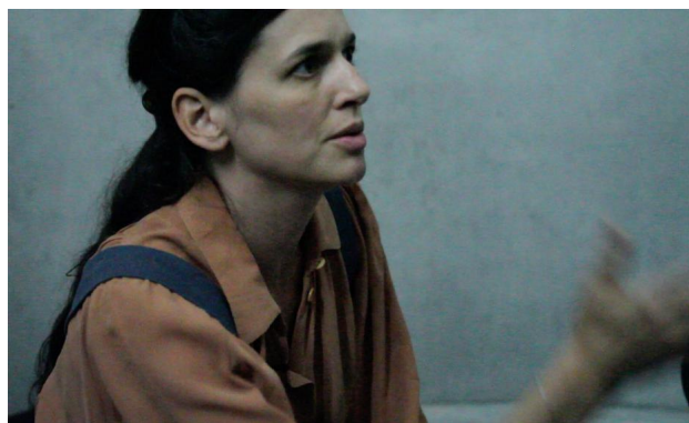
Behind the scenes at Simon's New York performance at Park Avenue Armory.