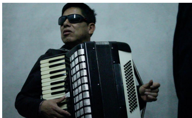
Behind the scenes at Simon's New York performance at Park Avenue Armory.