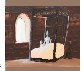
All works Courtesy of the Artist and Almine Rech Gallery