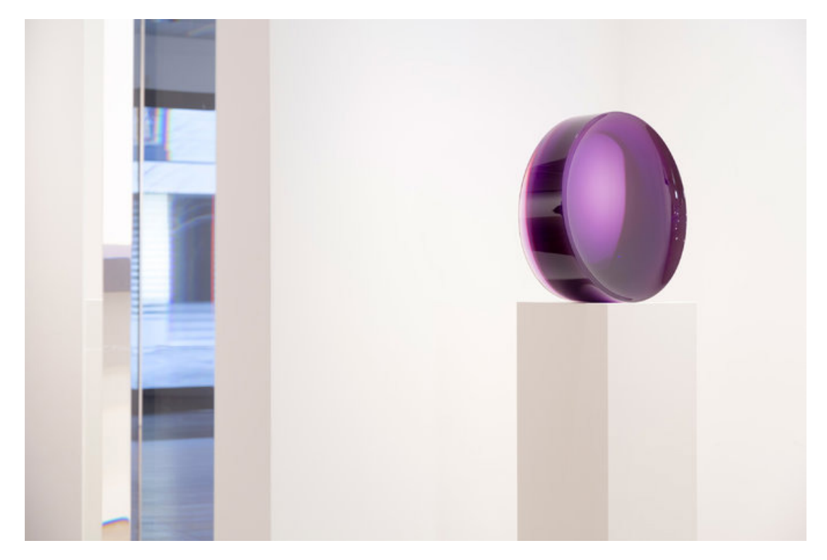
Another view of the show.

Equally influential on the art scene of the time was the Californian culture of "boating, surfboards and hot rods," as Valentine puts it. The high sheen of his sculptures comes courtesy of buffing and lacquering know-how picked up at his parents' auto garage. Works in the show by John McCracken, by contrast, draw directly from surf culture. His columns, "paintings" and planks are constructed from plywood and fiberglass with a glossy shell of polyester resin, just like a surfboard.