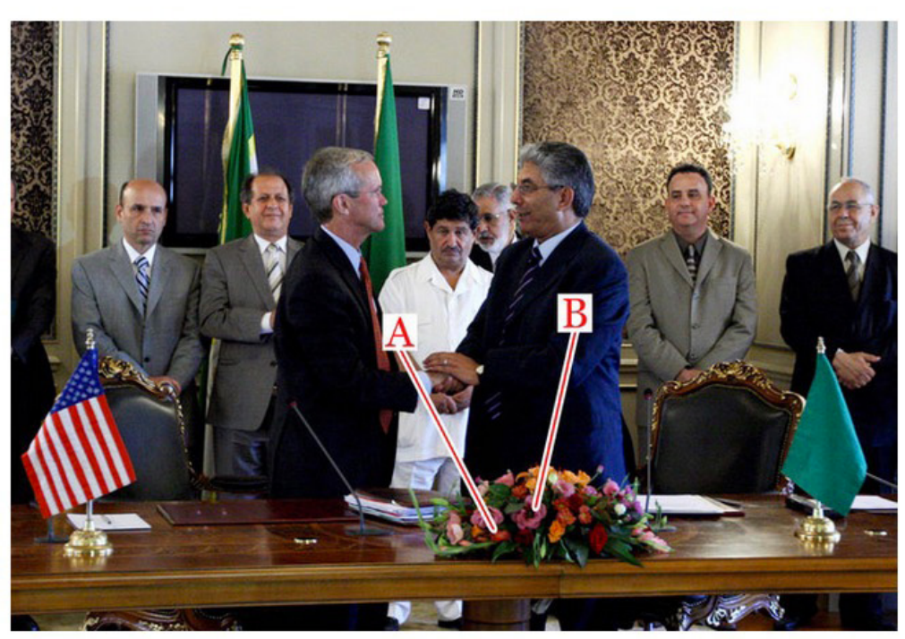
Source image with botanist's identifications.