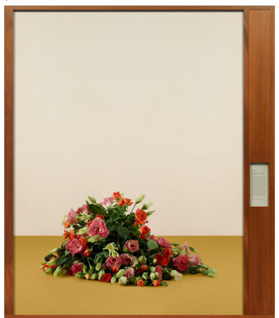
Comprehensive claims settlement agreement between Libya and the United States. Tripoli, Libya, Aug. 14, 2008, from "Paperwork and the Will of Capital," 2015.

On Photography By TEJU COLE NOV. 29, 2016