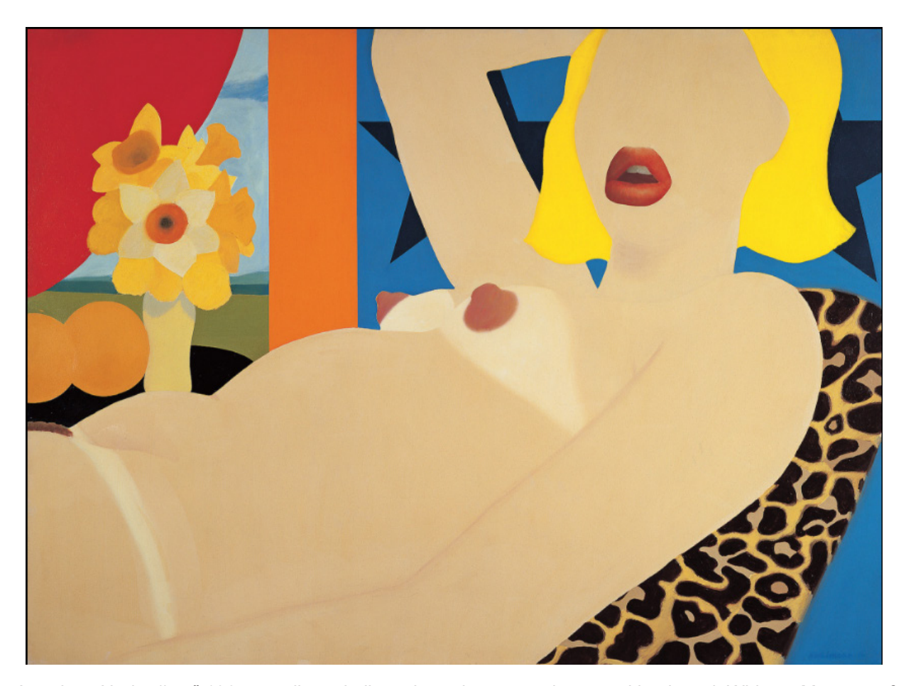
"Great American Nude, #57," 1964, acrylic and oil on shaped paper and composition board, Whitney Museum of American Art, New York, purchased with funds from the Friends of the Whitney Museum of American Art, ©The Estate of Tom Wesselmann/licensed by VAGA, New York, NY