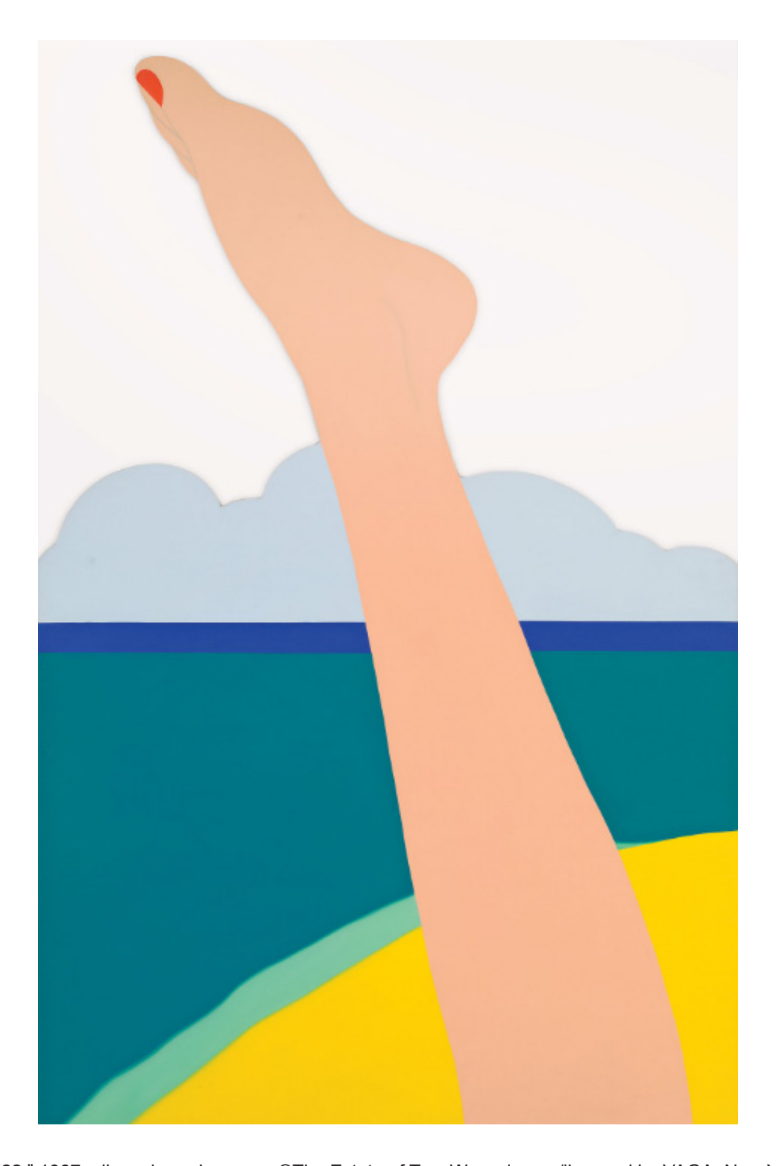
"Seascape #22," 1967, oil on shaped canvas, ©The Estate of Tom Wesselmann/licensed by VAGA, New York, NY