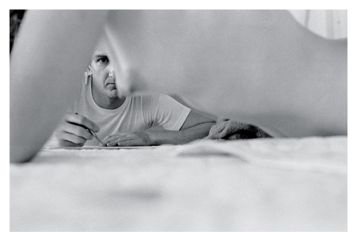
Sketching a model for a Drop-Out painting in 1967. Over the course of his five-decade career, Wesselmann completed close to 1,000 fully realized works in various media. © Bob Adelman