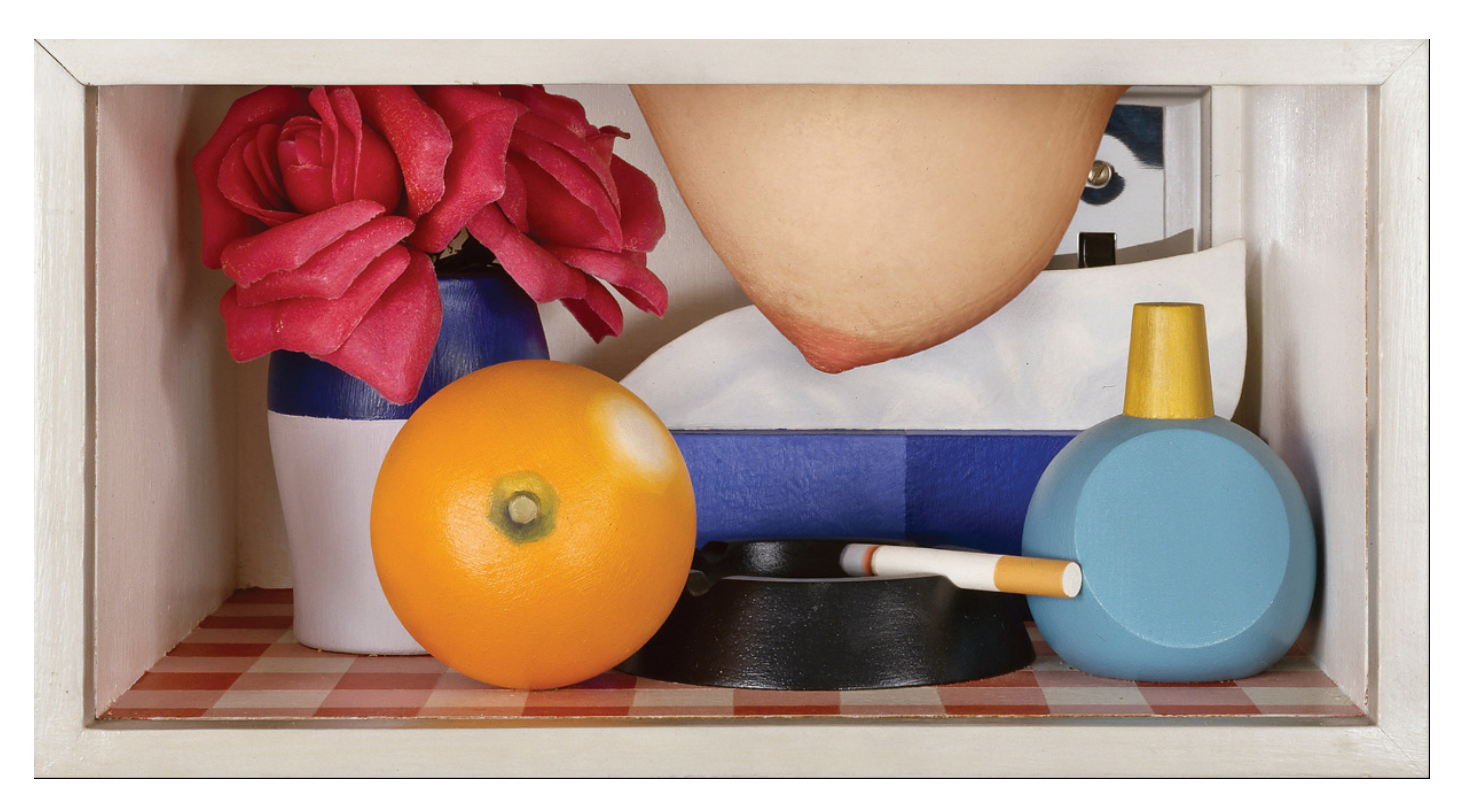
"Bedroom Tit Box," 1968-70, included a human breast (the model lay above the box, concealed from view by a wall), and an orange, a recurring motif in the artist's early work.

"Bedroom Tit Box," 1968-1970, oil, acrylic, collage and live tit, ©The Estate of Tom Wesselmann/licensed by VAGA, New York, NY