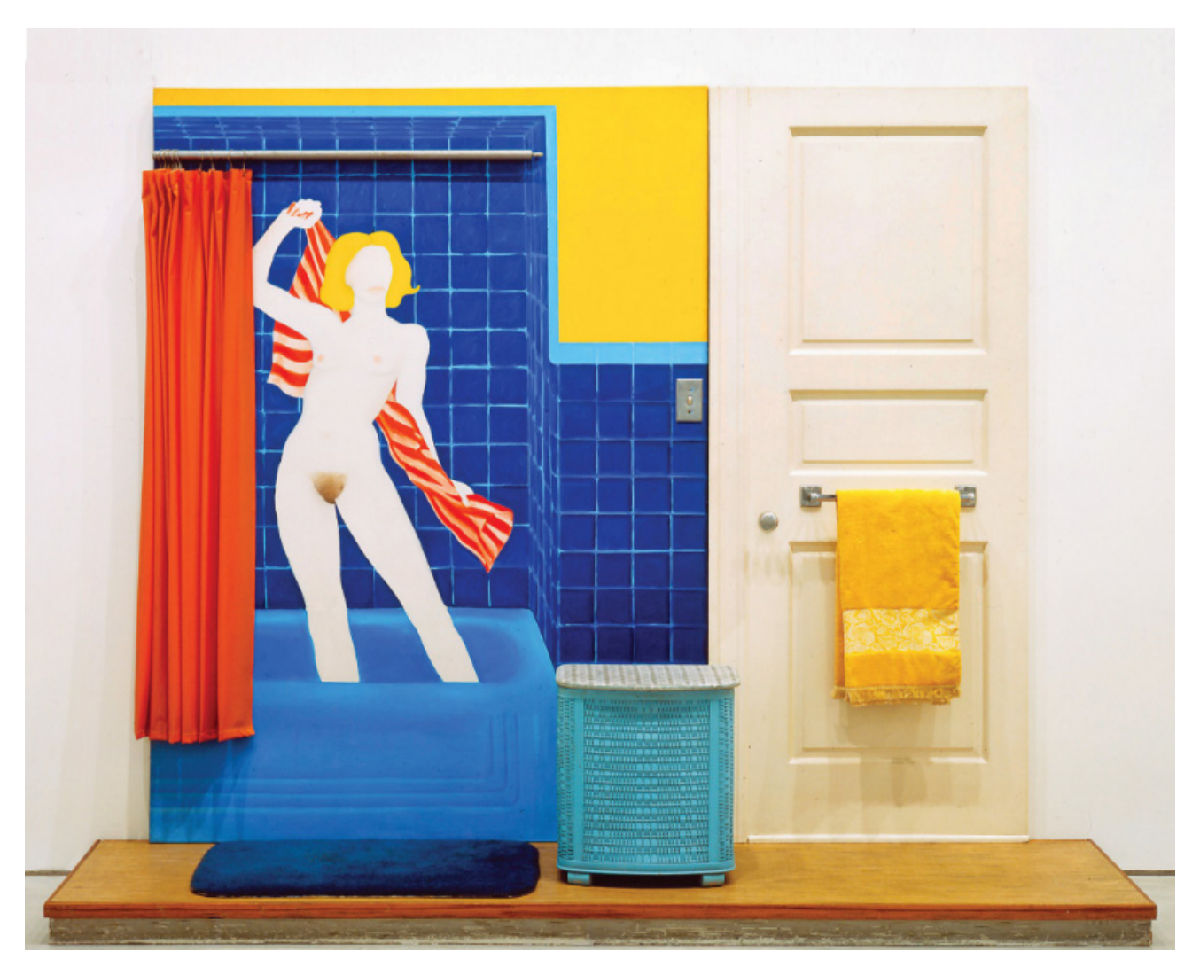
"Bathtub Collage #3," 1963, mixed media, collage and assemblage on board, Museum Ludwig, ©The Estate of Tom Wesselmann/licensed by VAGA, New York, NY