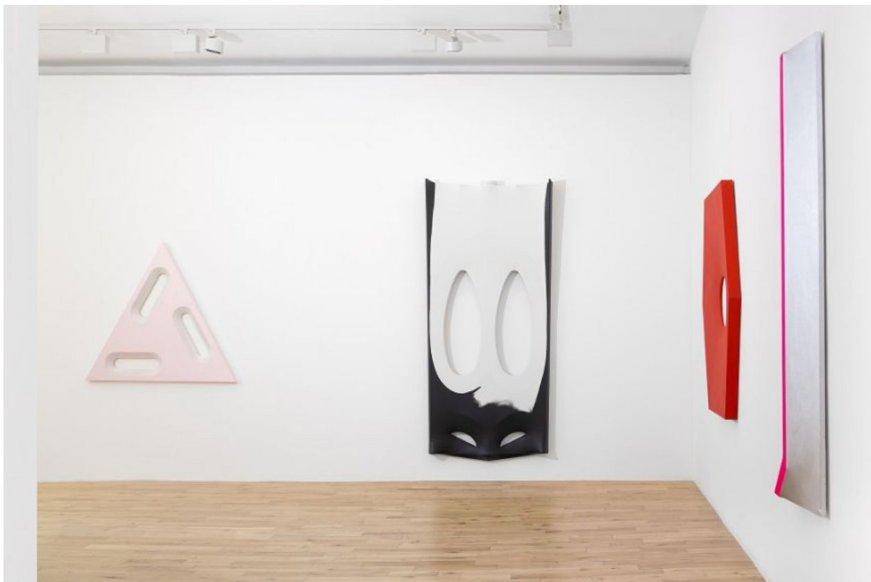
Installation shots of Blair Thurman, Mature Blonde at Almine Rech Gallery London until May 14 2016

or four months to do all the structures and then it's something like a month to do all the painting. It is time-consuming: You spend many days doing the assembling, priming and filling, then it is stretched and there is even more priming and sanding. By that time, you have had a lot of contact with the work. All that time you are thinking 'what color?' and 'what color were the other ones?' You've had all this time to come up with an idea, and that's why the painting is often sketchy and quick. If I were to lay on many layers and make it like a kind of automobile paint, it would be quite different, so that's the reason for the thin surface.