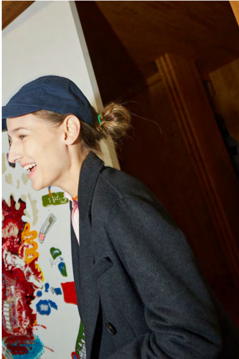
Leelee Kimmel.

After getting her start at just 11 years old, Kimmel took her last acting role at 27, signing on reluctantly because of her finances. "I had a really happy childhood, and had a lot of fun, and did some work that I feel good about. I feel blessed I was able to have these experiences that seem to other people to be very desirable," she said. As Kimmel speaks, you can hear the "but" coming. "In my paintings there's a lot about energy and vibrations and the whole world being connected," Kimmel explained, contrasting that sense of control to the experience of being on a film set. "If you're on a crew and 150 people are pushing for you to fall in love with somebody else, everybody is rooting for it. That's the energy of a lot of people, but it's fake."