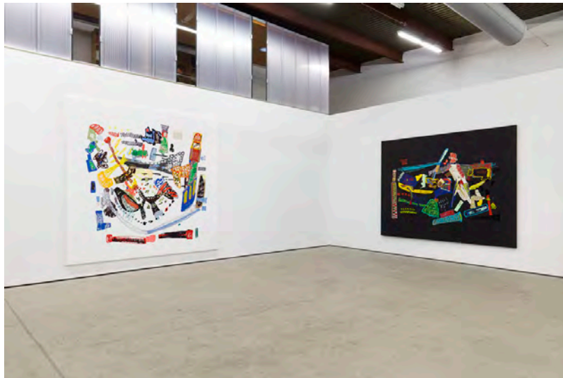
“Leelee Kimmel: Channels” installation view at the Journal Gallery. Courtesy of the Journal Gallery and the artist.