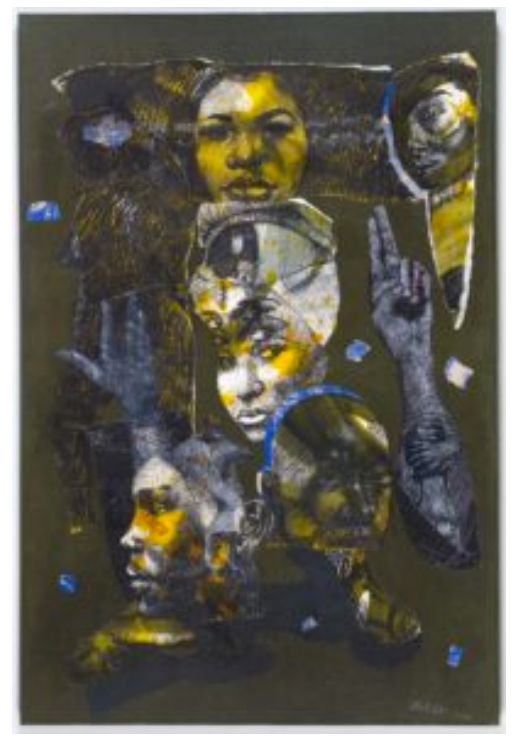
Griot/Sun Goddess, 2020, collage drawings, acrylic on canvas, 150 x 100 cm, image courtesy Melrose Gallery