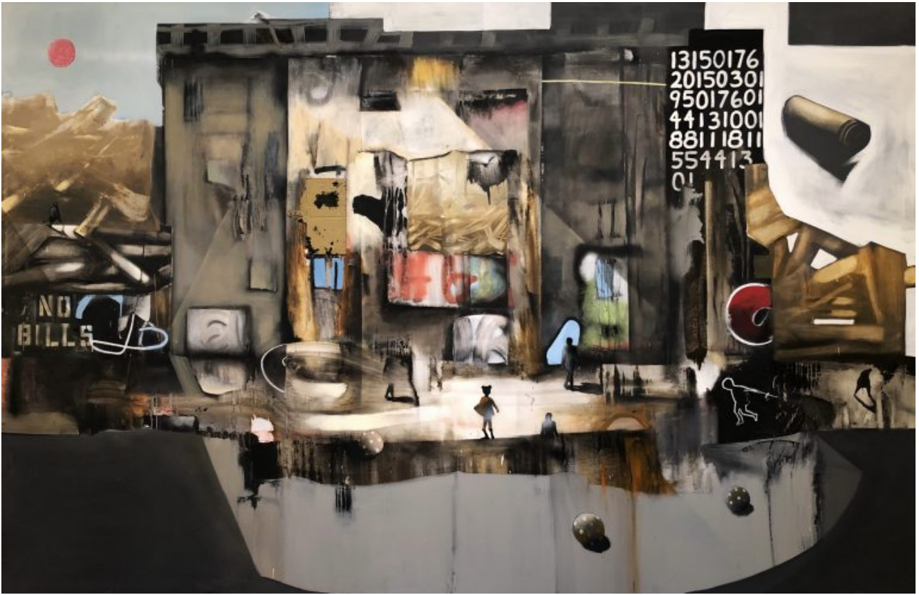
Spotlight.

It was a great opportunity to reflect on my priorities that seems to come with any life-threatening crisis. To me, it underlined the urgency of how important it is to have concern for others. Professionally, my work received more attention than in the last 30 years. I assume is that people's consciousness has been raised and they now see parallels in my work that may have seemed less urgent before. I was more concerned about others during this terrible year, and my art making shifted to factor in current events as themes.