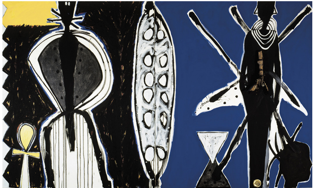
Ouattara Watts, The Woman of Magic Power , 1989, diptych, mixed media on canvas, overall 5' 11" x 14' 6".

doilies, hand-dyed textiles, and intricately painted cosmic bursts. Within this crowded field of recurring signs and symbols are characters either known from pop culture or recognizable through repetition.