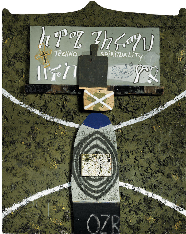
Ouattara Watts, OZB , 1993, acrylic, book, wood, and mixed media on two wood panels, 91 3/4 × 72 × 7".

A gift from Agnes Gund, a champion of Ouattara's work, it was the first of what Nzewi hopes will be several acquisitions, allowing for multiple and more complicated stories about it to be told.