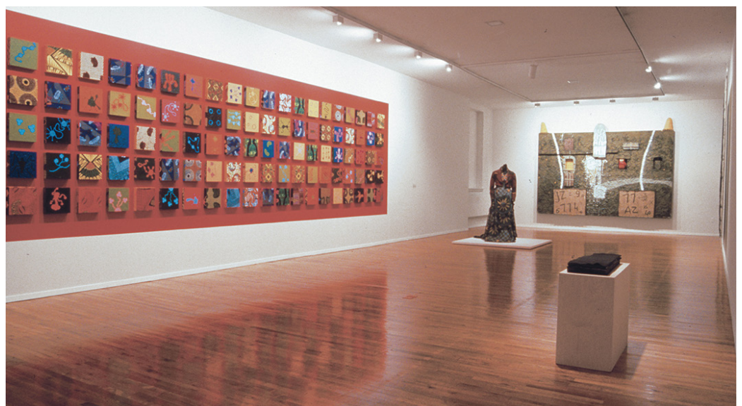
View of “The Short Century: Independence and Liberation Movements in Africa, 1945–1994,” 2002, P.S.1 Contemporary Art Center, New York. Wall, from left: Yinka Shonibare CBE, One Hundred Years, 2000; Ouattara Watts, Amon, 1993–94. Floor, from foreground: Ghada Amer, Untitled, 1990; Yinka Shonibare, Girl/Boy, 1998.