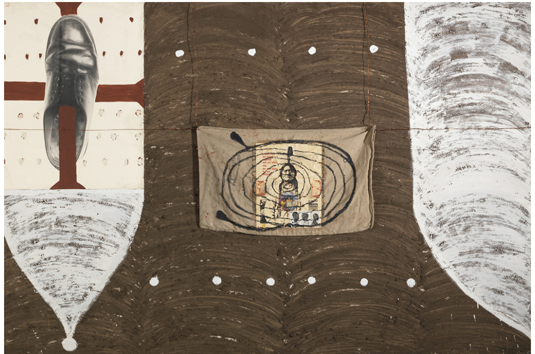
Ouattara Watts, Cultural Alchemy , 1999, found and printed paper, copper wire, clay, and acrylic on canvas and burlap sack, 7' 10" x 11' 9".

By Kaelen Wilson-Goldie September, 2021.