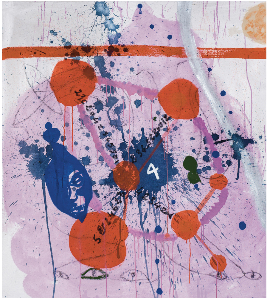
Ouattara Watts, Splash of the Spirit , 2018, mixed media on canvas, 54 × 48".

By Kaelen Wilson-Goldie September, 2021.