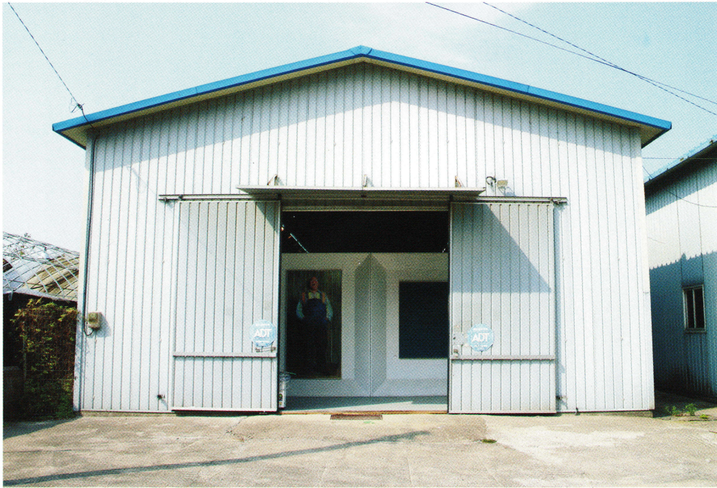
(Top) A warehouse-turned-gallery is situated in a spacious concrete courtyard. Inside to the left is a portrait of the exuberant artist.