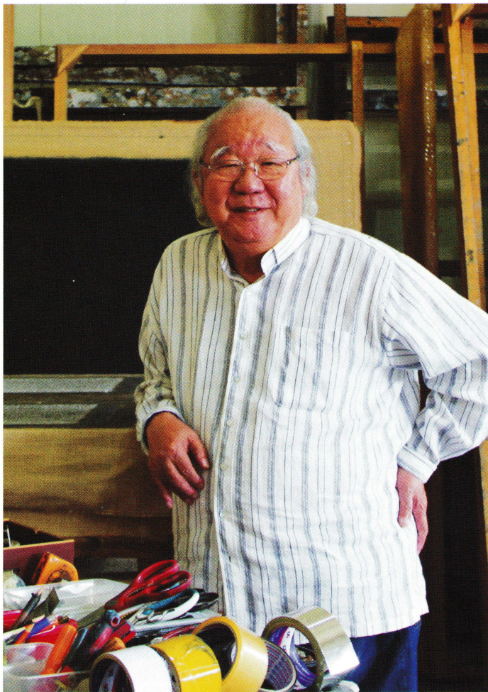
Ha Chong-Hyun standing next to signature burlap canvases in his studio in Ilsan, South Korea.

The secluded studio of a seminal Dansaekhwa artist reveals ongoing experimentations with burlap material and monotone paints