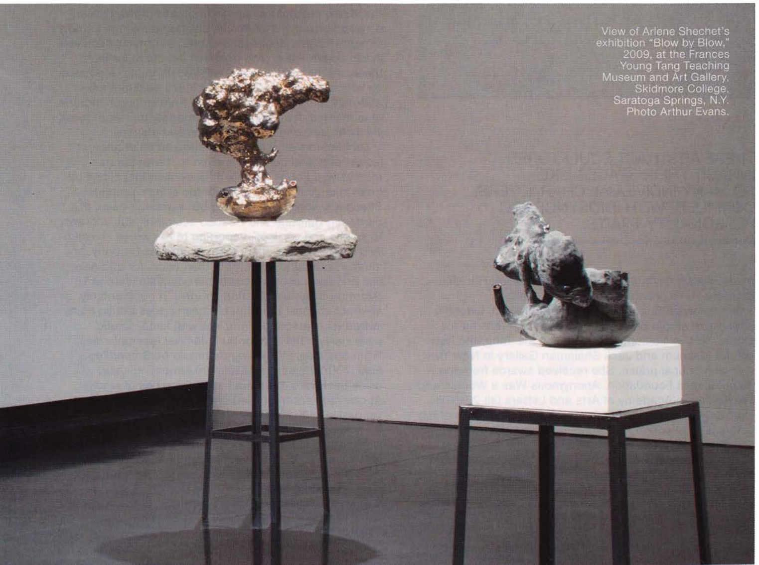
View of Arlene Shechet's exhibition "Blow by Blow," 2009, at the Frances Young Tang Teaching Museum and Art Gallery, Skidmore College, Saratoga Springs, N.Y.

but some white; she added touches of color only here and there. In her 2009-10 exhibition "Blow by Blow," at the Tang Teaching Museum in Saratoga Springs, N.Y., these eccentrically shaped vessels of subtle hue stood atop narrow metal-legged stools of various heights, among which viewers strolled in a meditative atmosphere. Variations in opacity enliven the surfaces of the sculptures, so that they appear at once wet and dry, shiny and matte. Open flues and spouts reveal unglazed reddish interiors, adding additional chromatic details and enhancing an impression that the objects are breathing. Beginning in 2009, taking a cue from earlier, small vessels more adventurously and playfully conceived (she showed a group of these at Elizabeth Harris Gallery in New York in 2007), Shechet shifted to a more unpredictable range of textures and hues, still inviting accident and moment-