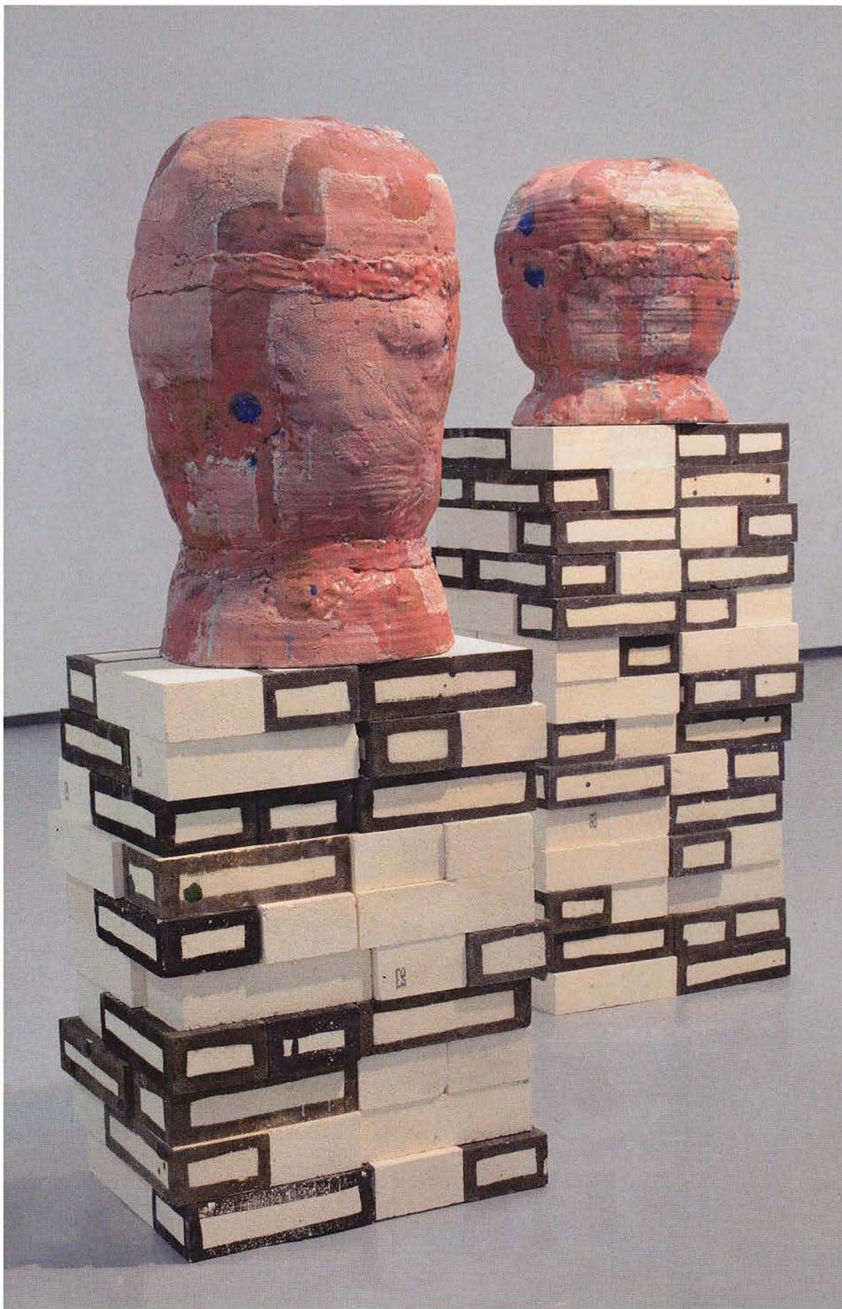
Left, So and So and So and So and On and On , 2010, glazed and fired ceramic and glazed kiln bricks, each piece approx. 50 inches tall.