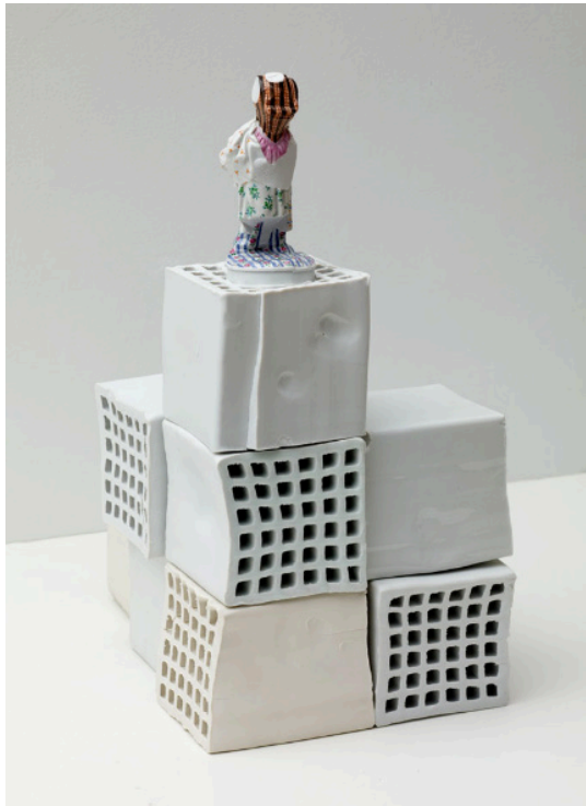
Arlene Shechet Gangsta Girl, 2012 «Arlene Shechet: All at Once» at ICA Boston, Boston (2015).