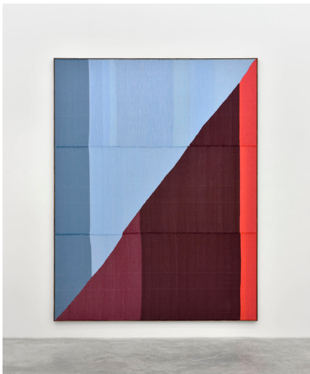
Brent Wadden, Untitled , 2016. Courtesy Peres