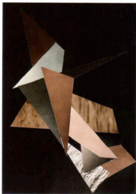
Katja Strunz Untitled (2007) Collage on paper 42x30.5cm