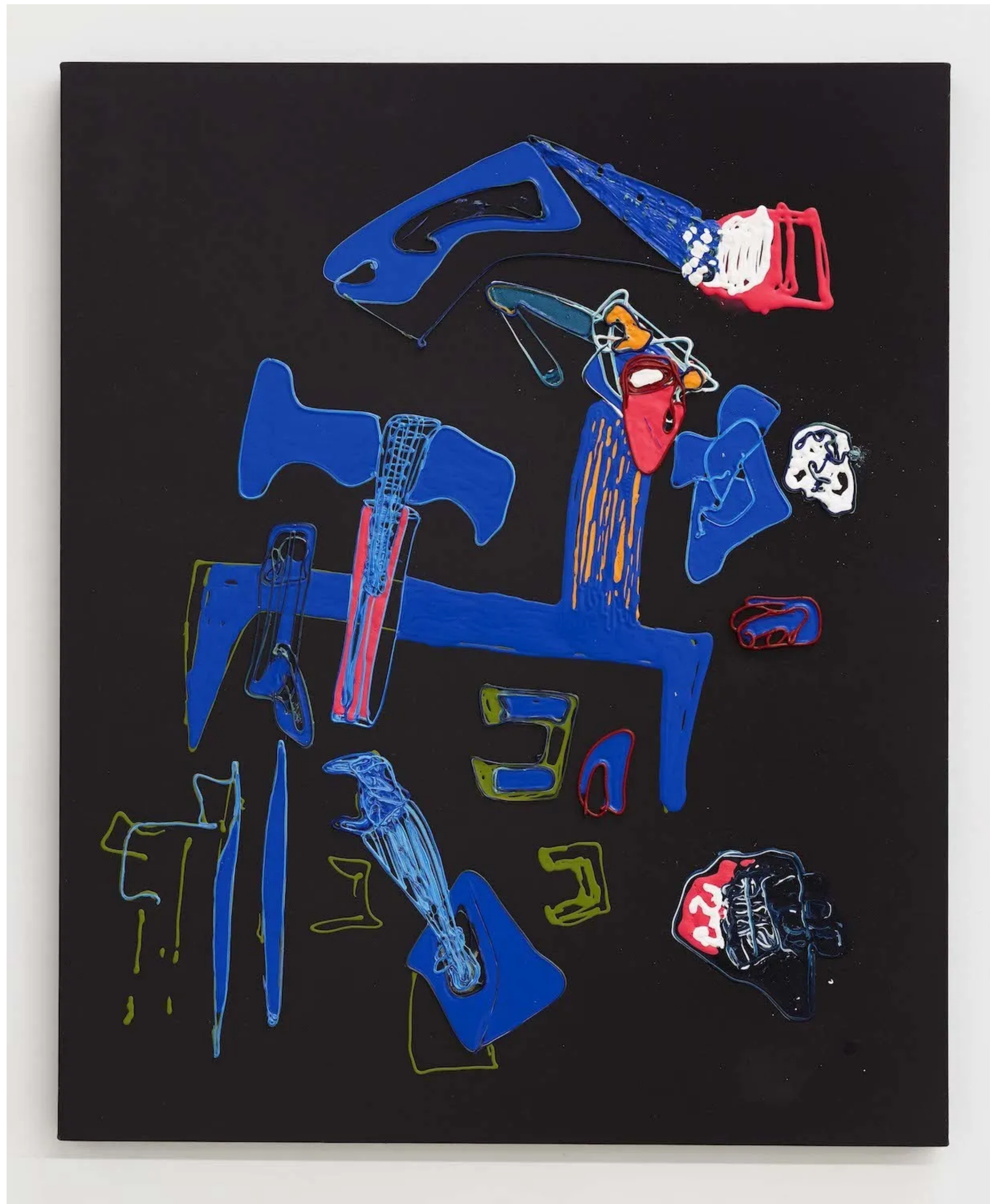
Leelee Kimmel, Little Screaming Rig , 2017, acrylic on canvas, 43 x 35".