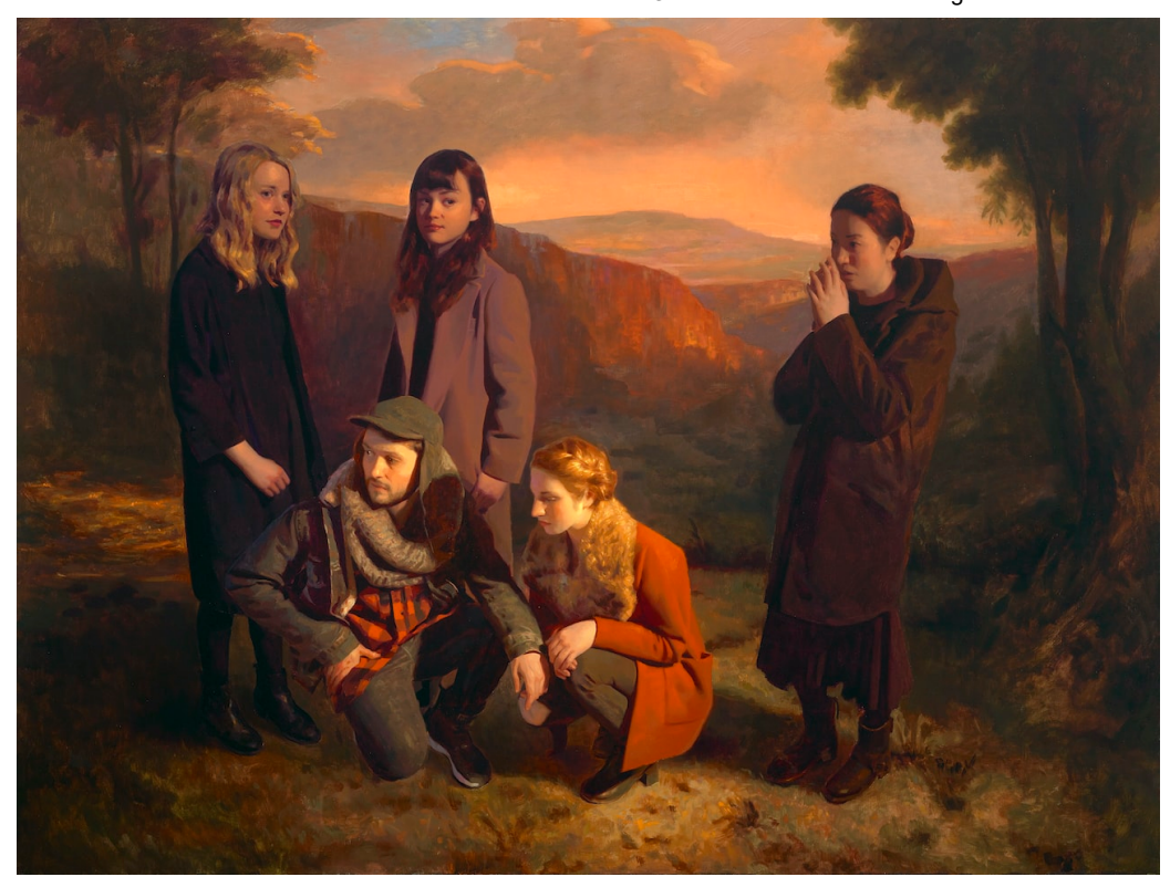
Pilgrimage, 2016, oil on linen, 72 x 96 inches