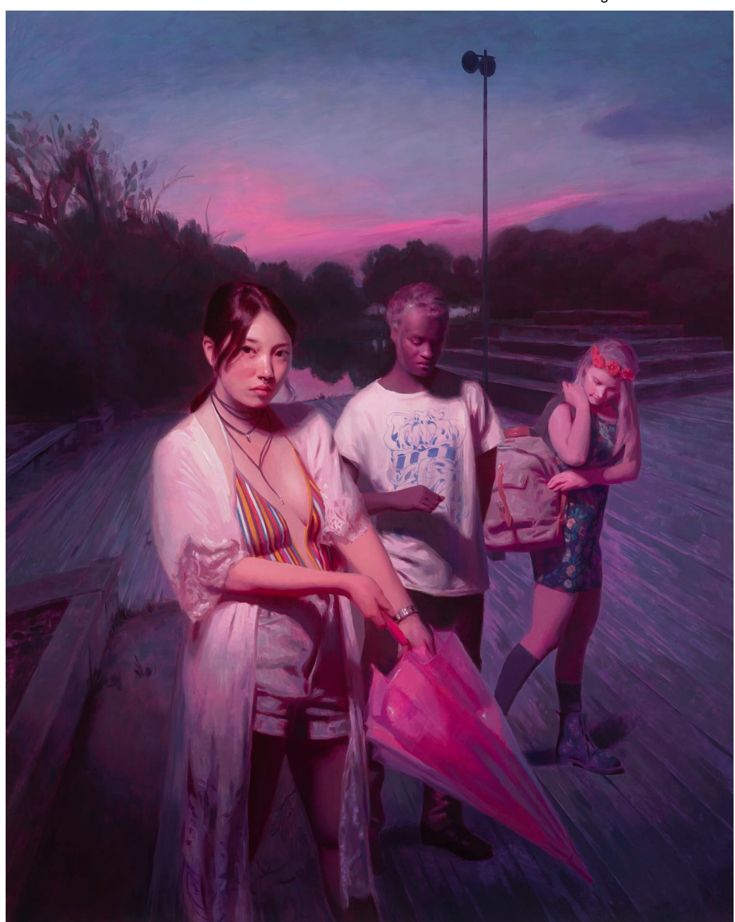
After the Rain, 2016, acrylic and oil on linen, 48 x 60 inches