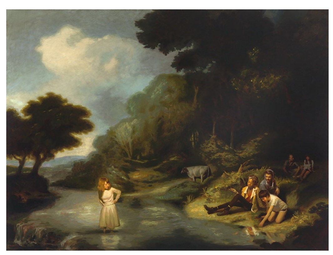
Europa, 2015, oil on canvas, 72 x 96 inches