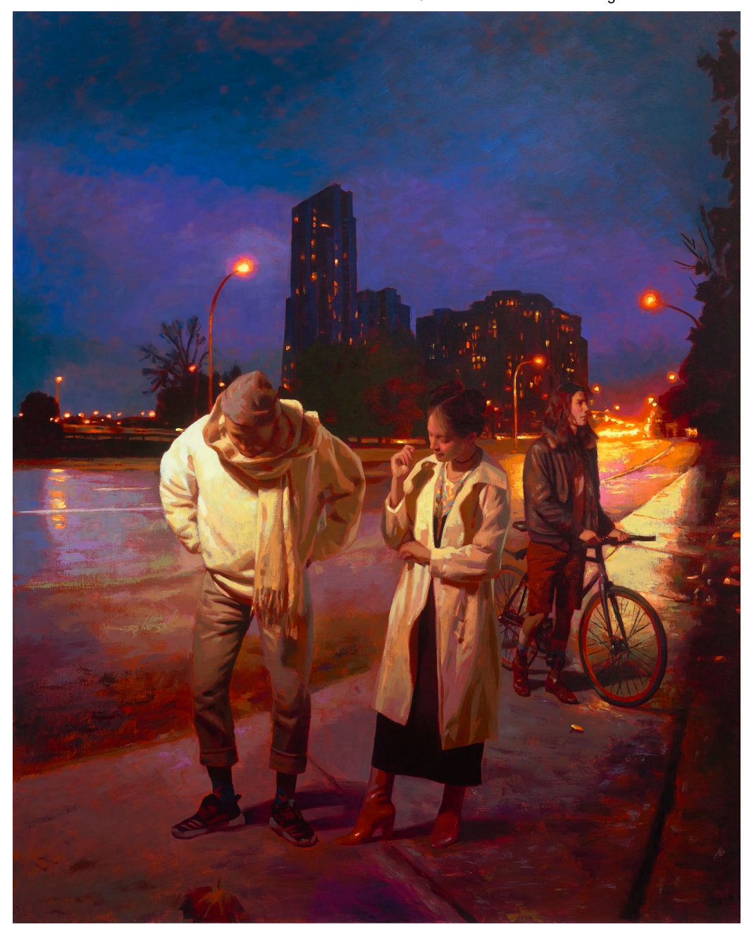
Convergence, 2017, oil on linen, 48 x 60 inches

Blending elements of Baroque traditionalism and an almost postmodern magical realism is clearly a broadly ambitious enterprise, so exactly just how much choreography does a Morimoto painting demand? "In terms of composition, a lot of figures aren't actually in the scene, they're superimposed with Photoshop. I want to create this cinematic effect like [American realist photographer] Gregory Crewdson. He'll often have a stage with houses and trees, an outdoor setup. I didn't have the budget that Crewdson does but I wanted to recreate that sense of choreography in my work as well as capturing the melodramatic quality of the figures.