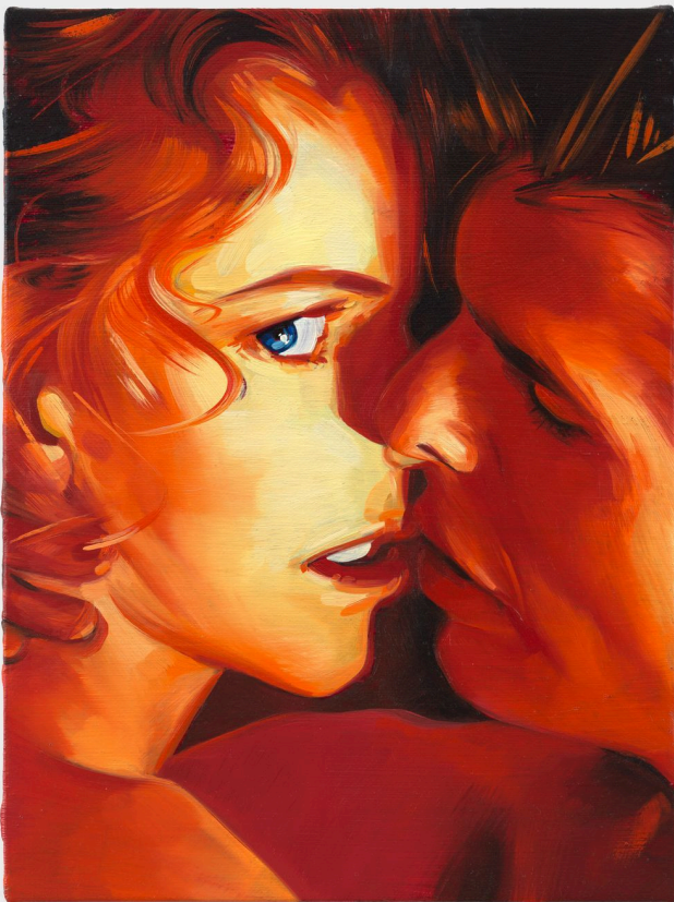
“Alice and Bill,” 2020. Oil on linen.

NGUYEN: You both talk about the impression or residue of films, but has the residue of 2020 changed