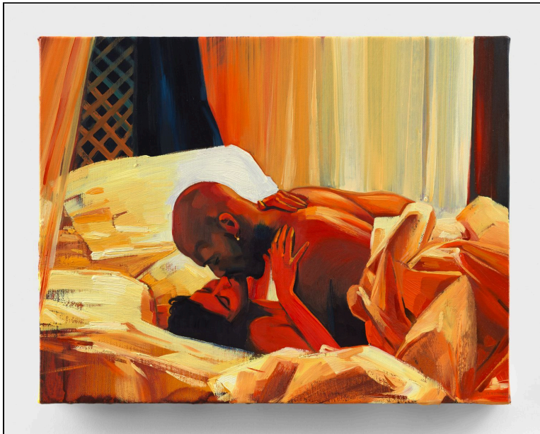
"Othello and Desdemona," 2020. Oil on linen.

storytelling and meticulous attention to detail attracted a wide audience. Everyone told me Rain Man was going to fail because it was too intellectual. I said to everybody, it's not going to fail, it's a family story. And it was the number one movie. We were told it would not do one nickel in Japan, and it was the number one movie in Japan too because it's all about family.