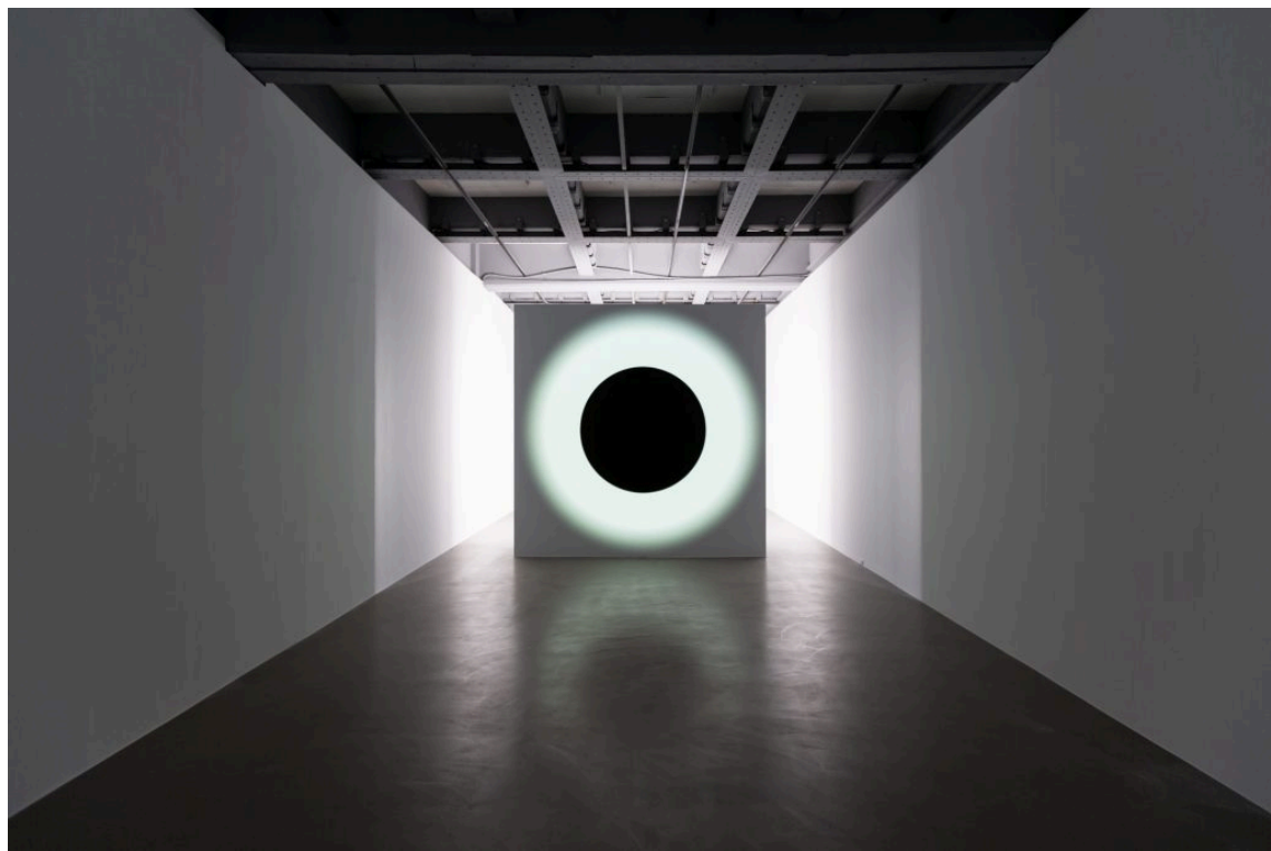
point of no return, 2018 © Ryoji Ikeda

The Vinyl Factory x Fact in collaboration with Audemars Piguet Contemporary to present RYOJI