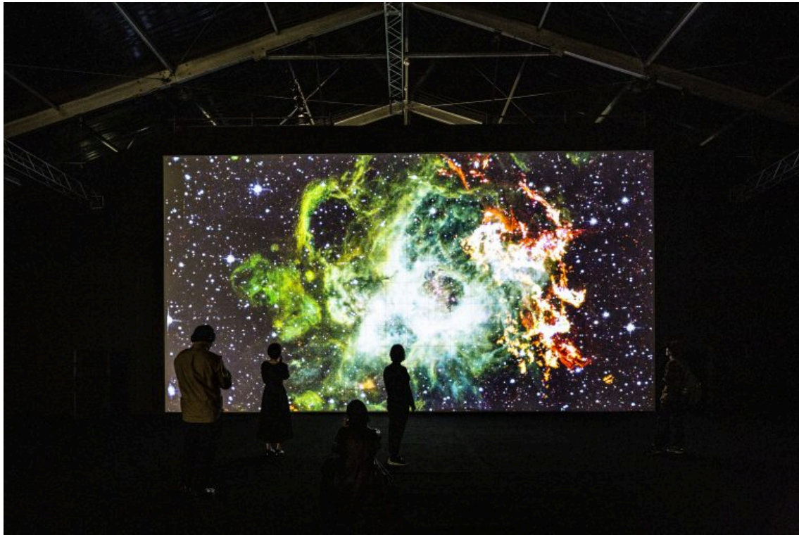
data-verse 2 (2019) © Ryoji Ikeda Studio. Courtesy of the artist and Audemars Piguet

Over the last 20 years, Fact magazine has operated at the intersection between electronic music and cutting-edge contemporary art. Now, launching with this Ryoji Ikeda exhibition, Fact will produce its own exhibitions, hosting a dizzying rotation of large-scale art shows open to the public with a focus on the new wave of artists creating immersive experiences, with the Fact Space opening in the basement of 180 The Strand in 2021. Imagined by Ikeda as a subterranean exploration of sound and light, the exhibition will take viewers on a sensory journey of 180 Studios' labyrinth-like spaces which seem to defy the building's scale. The exhibition will show how Ikeda has transformed the way we experience art and pioneered a global movement with immersive works that push our senses to new sonic and visual extremes, challenging our understanding of the universe and our place within it.