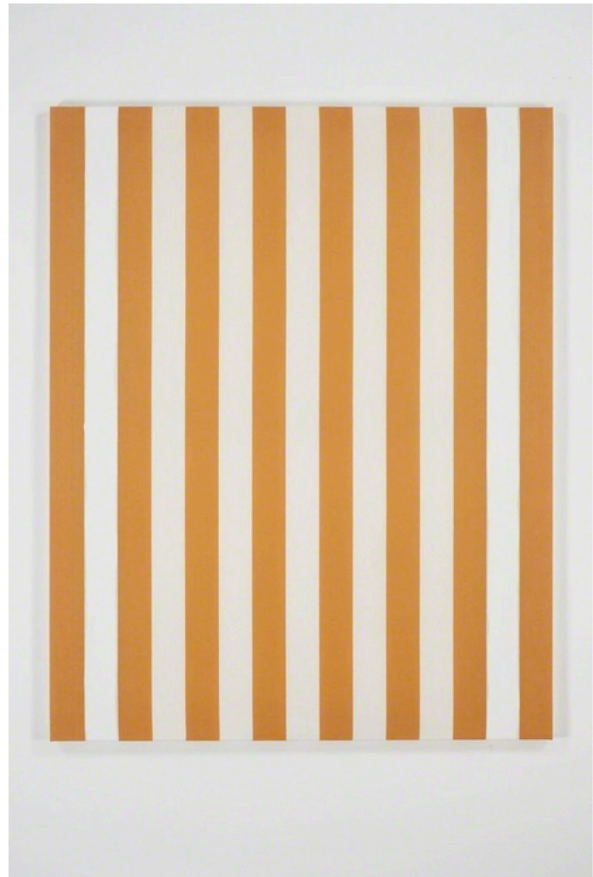
Daniel Buren Peinture acrylique blanche sur tissu rayé blanc et orange , February 1974 Bortolami

This blue abstract work skillfully plays off branding and news.