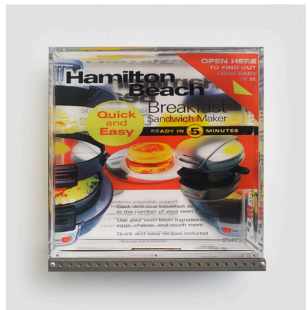
Zak Kitnick Quick and Easy , 2014 Clifton Benevento