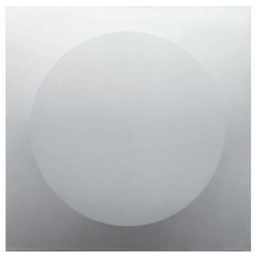
TURI SIMETI, Un tondo, 1989.