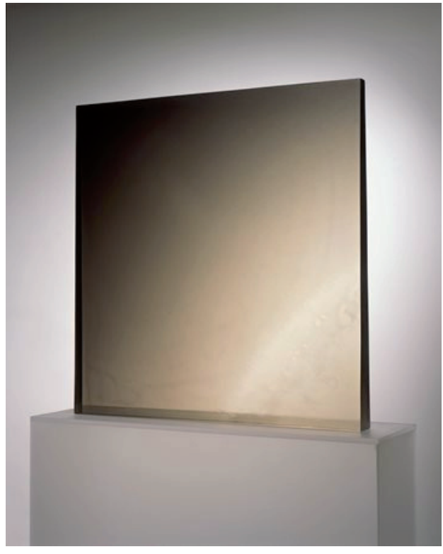
Dewain Valentine, Square gray dapple to black , 1970-71.