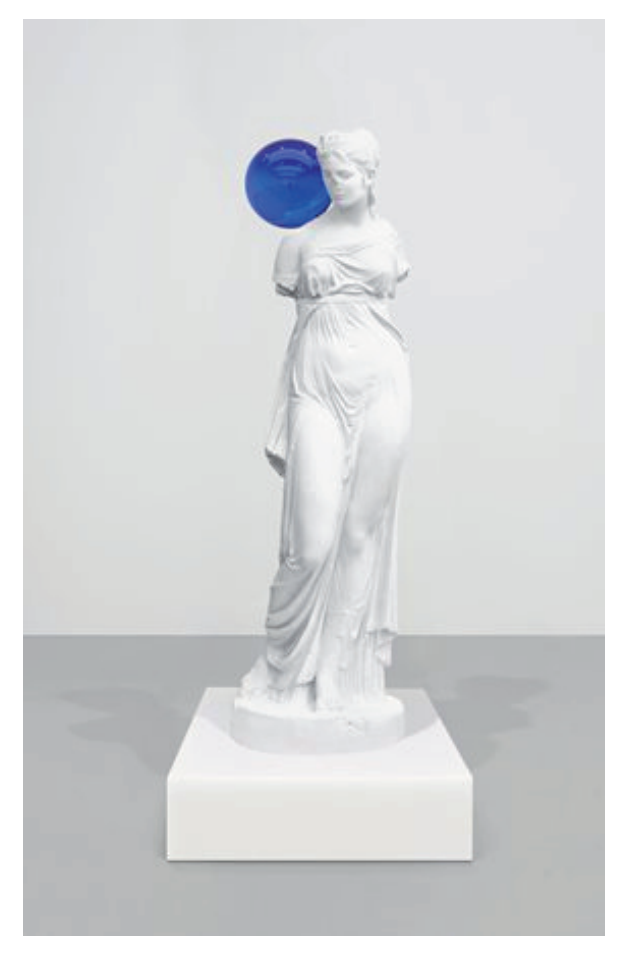
Jeff Koons, Gazing Ball (Demeter), 2014.