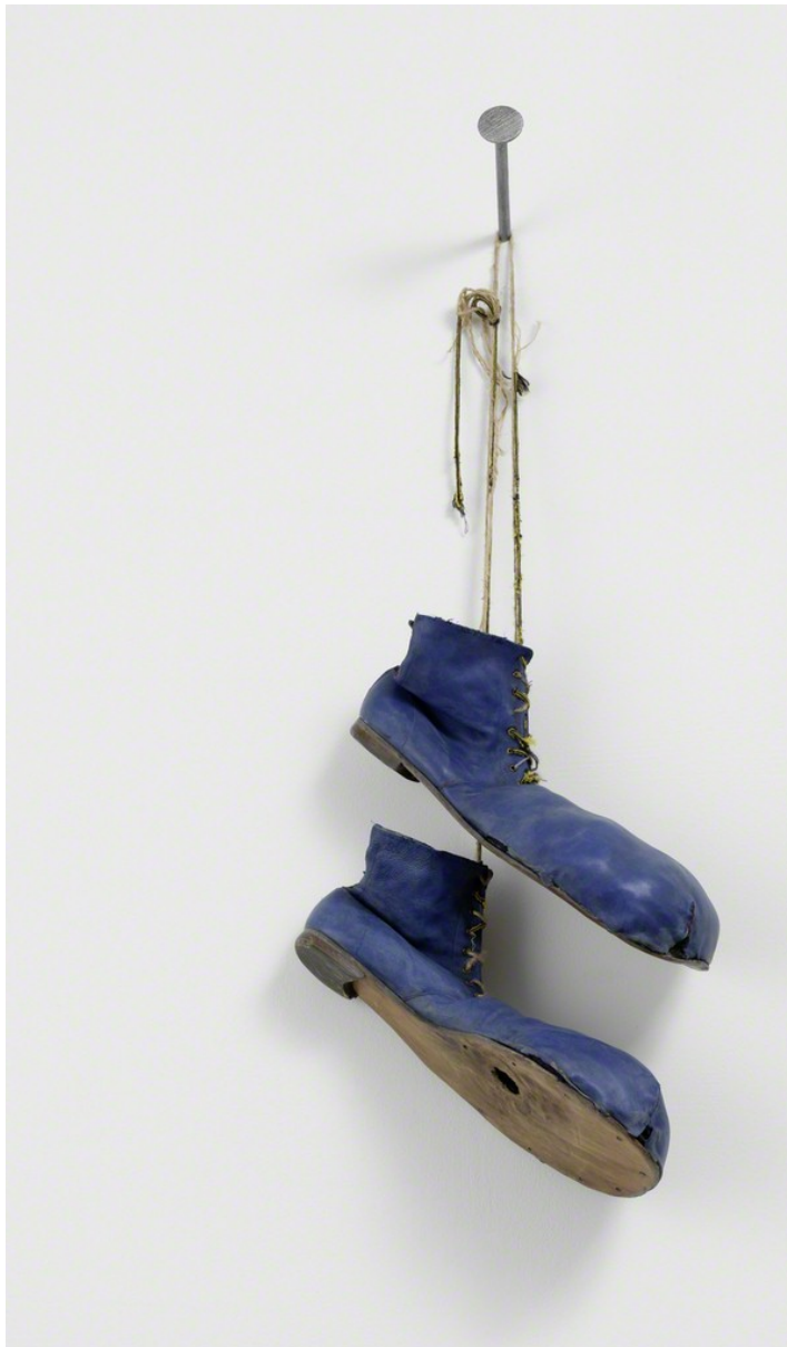
Ugo Rondinone no one's voice , 2006 Rockbund Art Museum