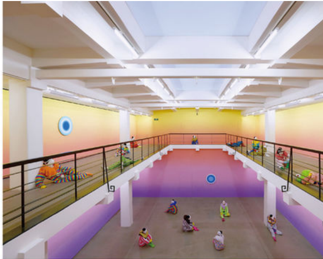
Ugo Rondinone sunset i-v , 2014 Rockbund Art Museum