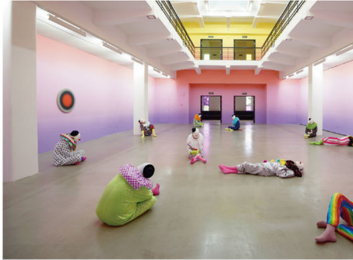
Ugo Rondinone vocabulary of solitude , 2014 Rockbund Art Museum