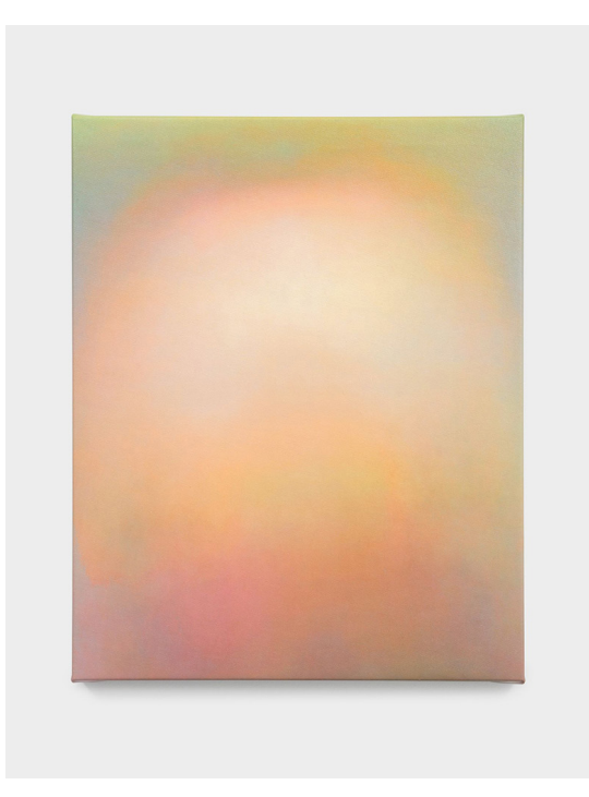
Gioele Amaro, Piece of a Piece , 2022, Ink and varnish on canvas, 158 x 140 cm 62 x 55 in. Photography by Nicolas Brasseur. Courtesy of the artist and Almine Rech.