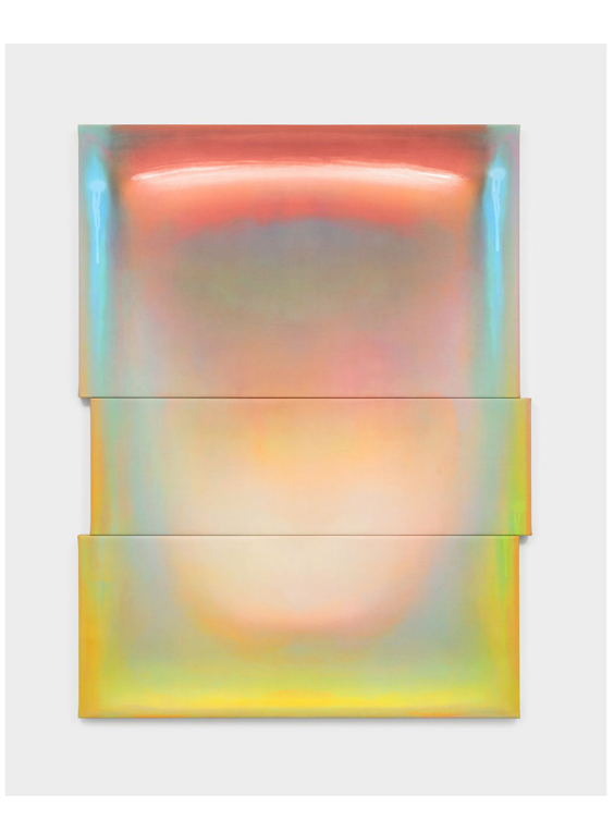
Gioele Amaro, Sliced Licence , 2022, Ink and varnish on canvas, 158 x 140 cm 62 x 55 in.