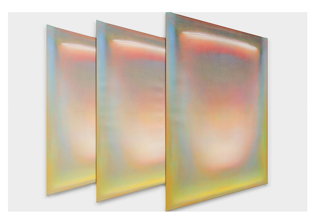
Gioele Amaro, P-P-Painting !, 2022, Ink and varnish on canvas, 158 x 140 cm 62 x 55 in.