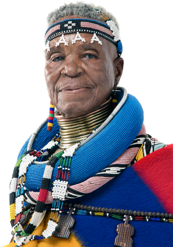
Dr Esther Mahlangu portrait.