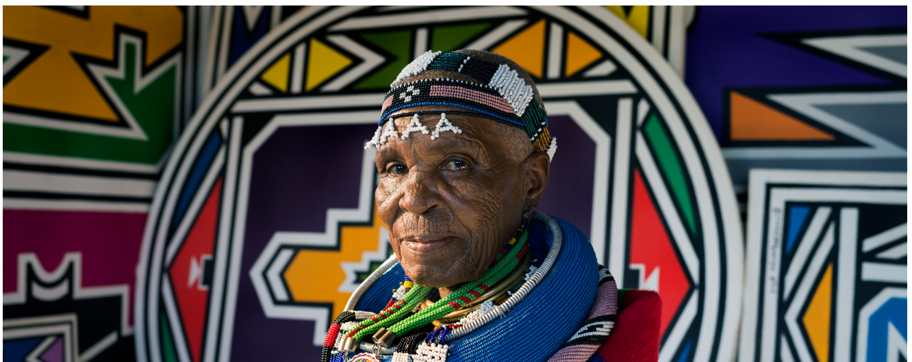
Dr Esther Mahlangu portrait.

‘One can immediately recognise the South African painter’s geometric style and dynamic colour intricacies’: Dr Esther Mahlangu is set to have a solo exhibition at the Almine Rech Gallery in Paris.