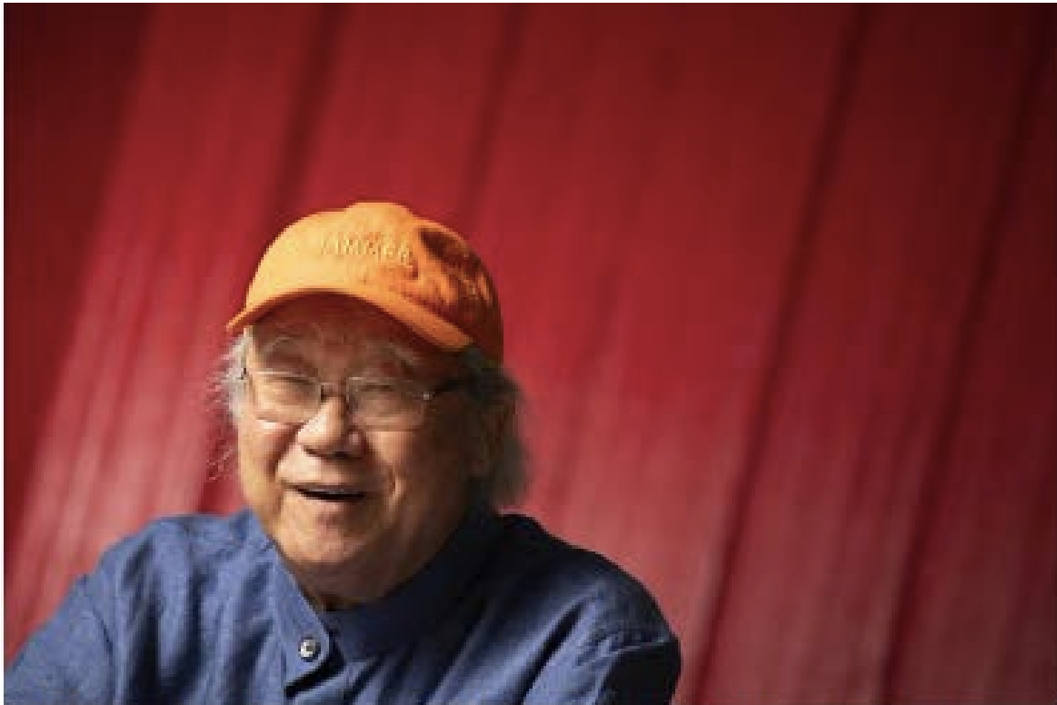
Ha Chong-hyun speaks during an interview with The Korea Times in June 2019.

Renowned dansaekhwa (Korean monochrome painting) artist Ha Chong-hyun opened a solo exhibition at Almine Rech Gallery London, Tuesday.