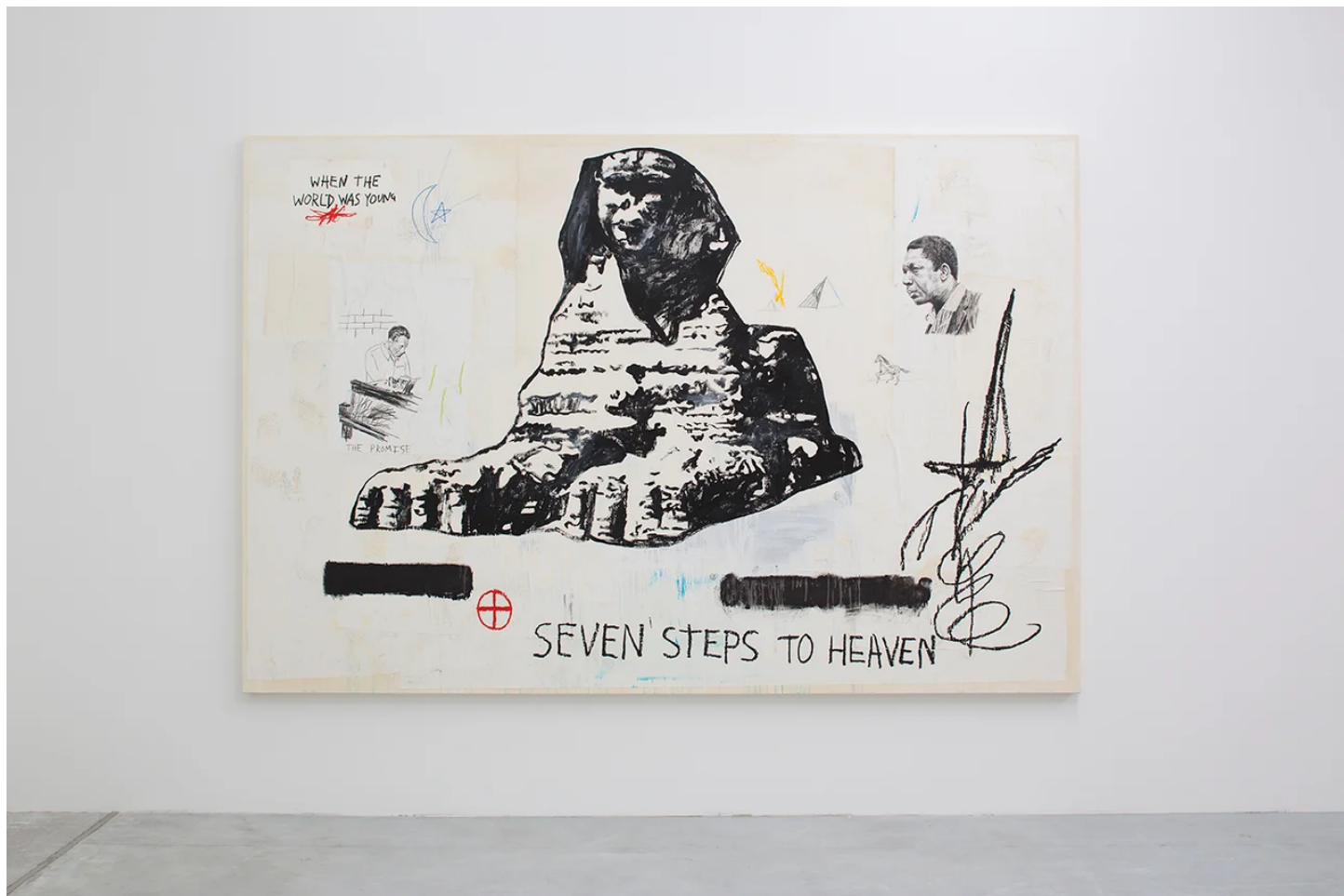
Going Places, 2016