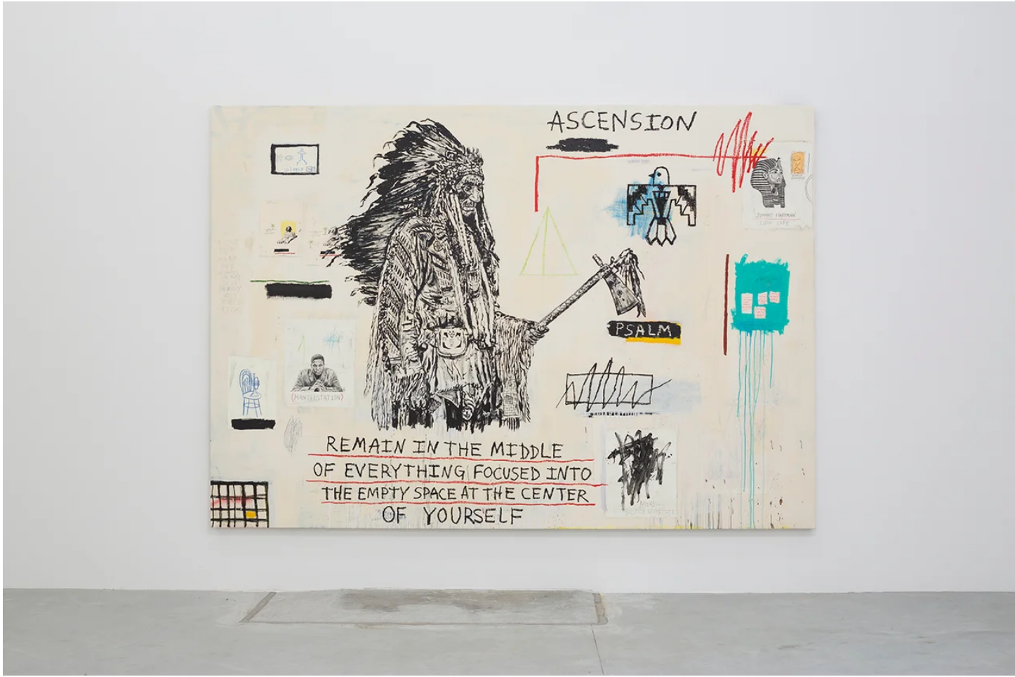
Fellow Traveler of Awareness, 2016