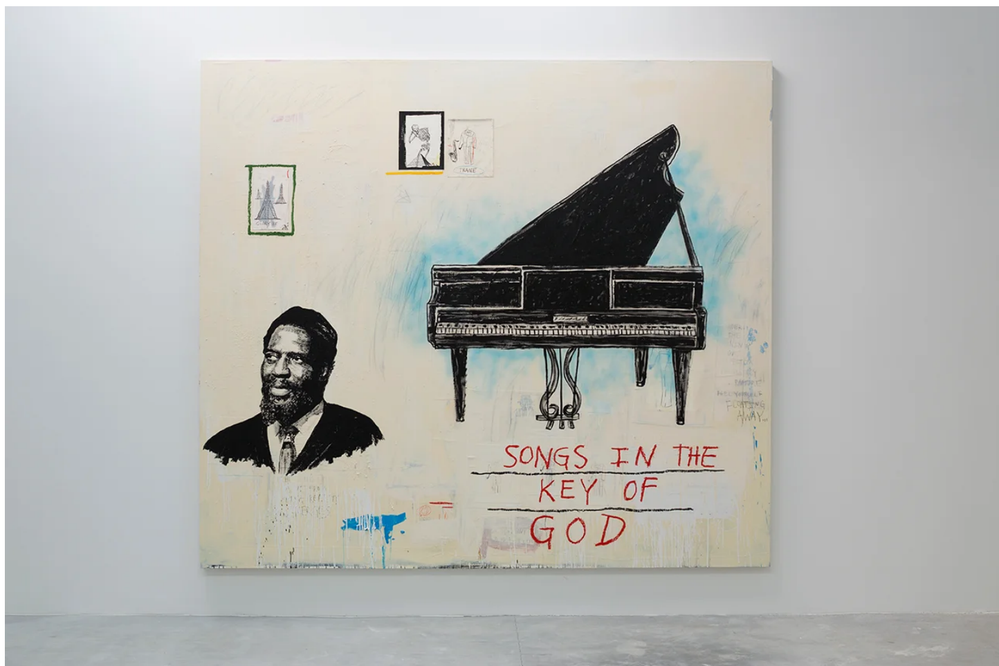
Unknown Ballad, 2016