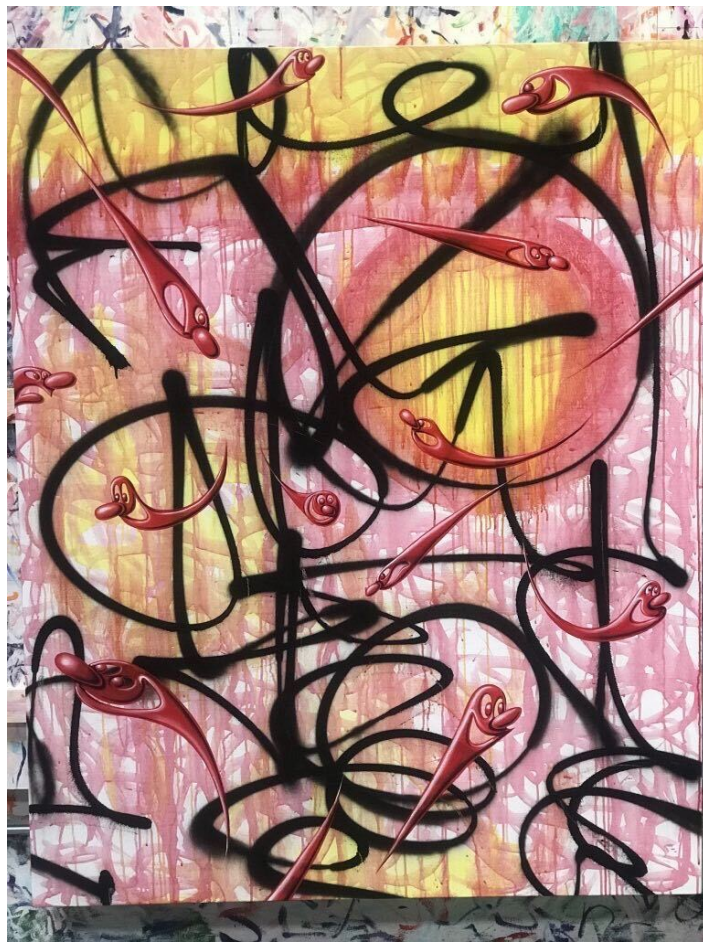
Kenny Scharf's work in progress, courtesy of the artist.

My studio itself—the walls and the roof. I'm very grateful that I have a place, and when it comes down to it, that's all I need. I could make art out of dust, but a place where I can be alone and do my thing is indispensable.