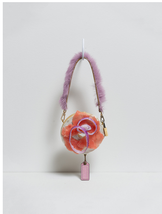
PBJLV, 2015, oil paint, urethane, hardware et Bagel and Locks, 2015, oil paint, urethane, hardware, fur