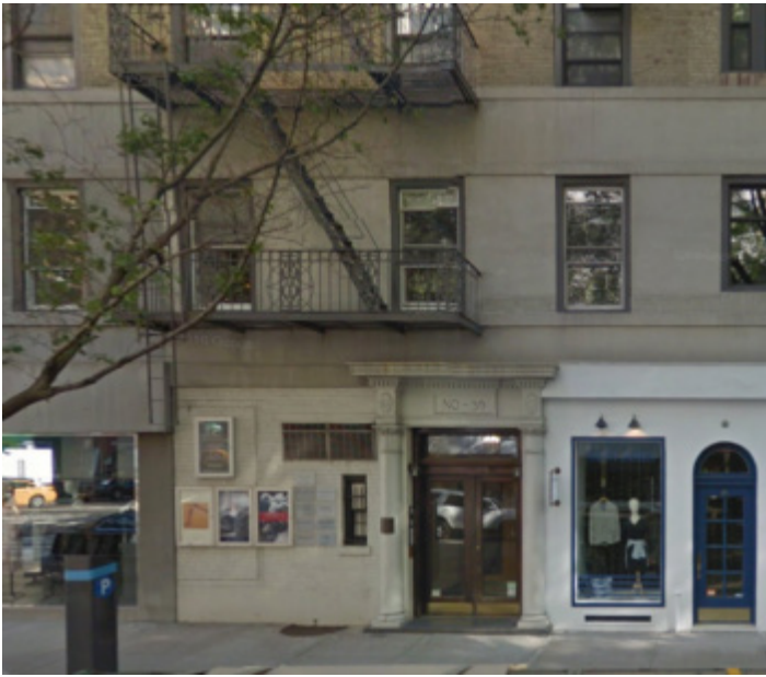
The outside of the new second-floor space.

"So it makes more sense to be uptown in the historical area," she added.