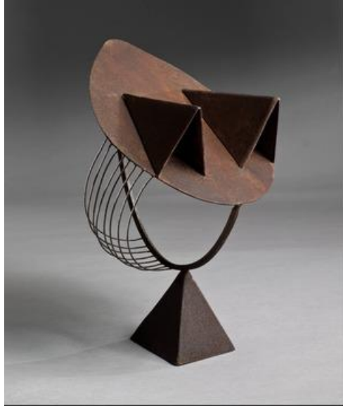
Perceiving Head by David Smith (1940)