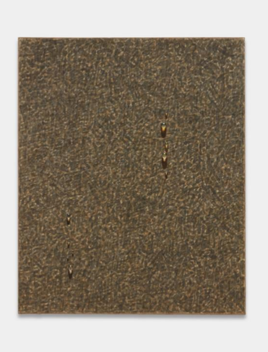
KIM TSCHANG-YEUL, Recurrence, 1989, oil and Indian ink on traditional Korean paper. 194 × 160 cm.

The "Recurrence" series (1989) perpetuates the feeling of nostalgia, both culturally and personally. Here, the water drops appear camouflaged by a rambling pattern, reminiscent of an overgrowth of branches and trees. Kim created the textured background, consisting of black ink on rice paper, by repeatedly writing Chinese text from the Book of 1,000 Characters until they overlapped. The process is a nod to the traditional practice of calligraphy that his grandfather taught him, and which served as his first experience of picking up the brush.