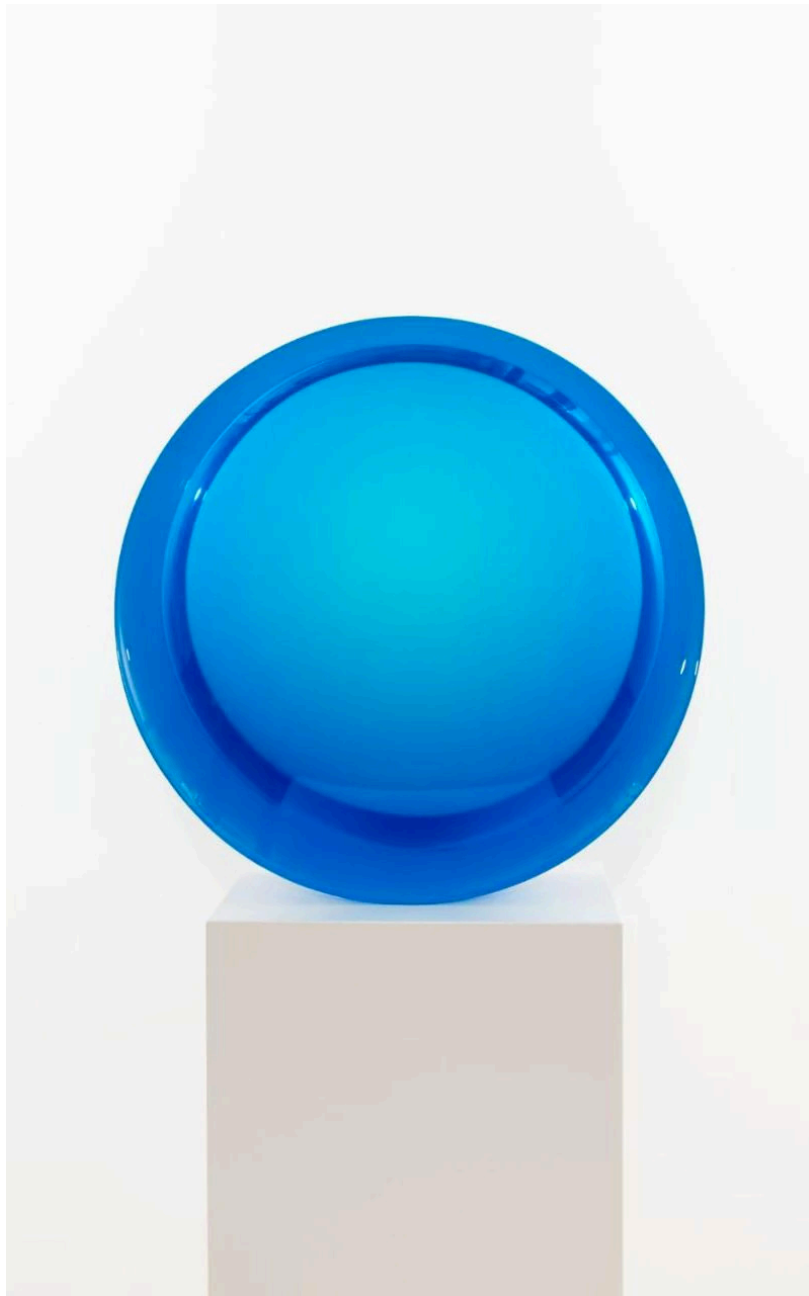
DeWain Valentine, Concave Circle Blue

Telegraph.co.uk: 'Plastic fantastic: Almine Rech celebrates the 1960s Light and Space Movement' by Colin Gleadell, February 7, 2017